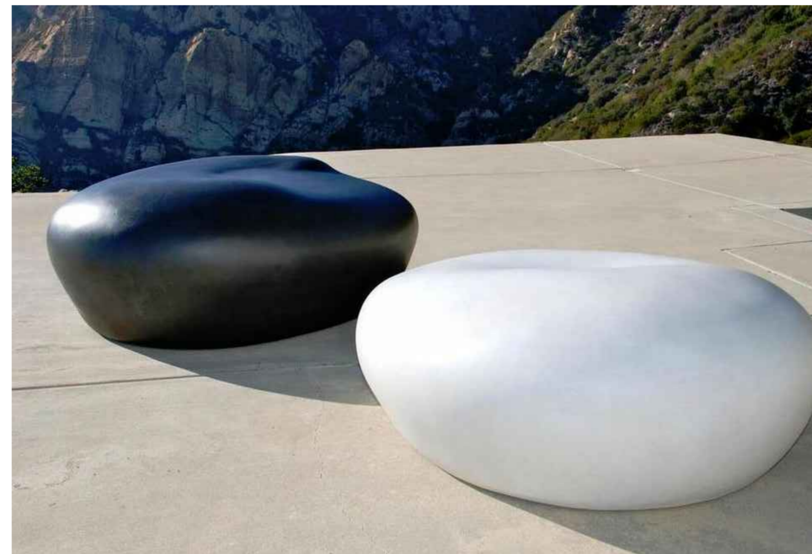
SITE BENCH OR APPROVED EQUAL NOT TO SCALE

MANUFACTURER: BOXHILL WEBSITE: WWW.SHOPBOXHILL.COM PRODUCT NAME: CAST STONE PEBBLE SEAT COLOR/MATERIAL: CONCRETE, LIGHT GREY & ANTHRACITE FINISH QUANTITY: 5, IN SMALL, MEDIUM AND LARGE