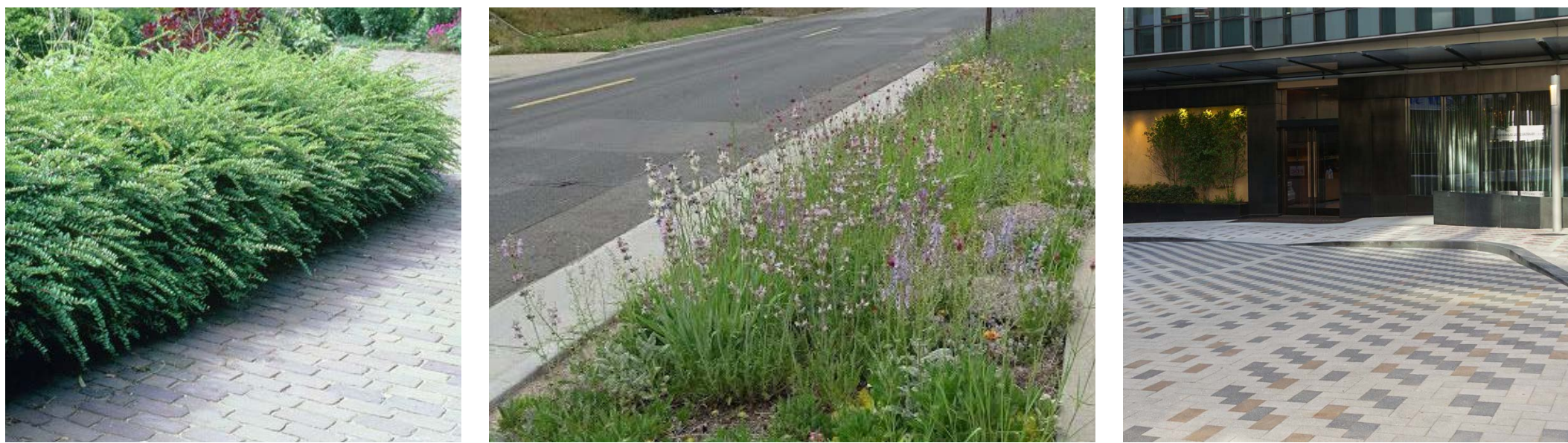
2 CHARACTER IMAGES - WESTERN EDGE