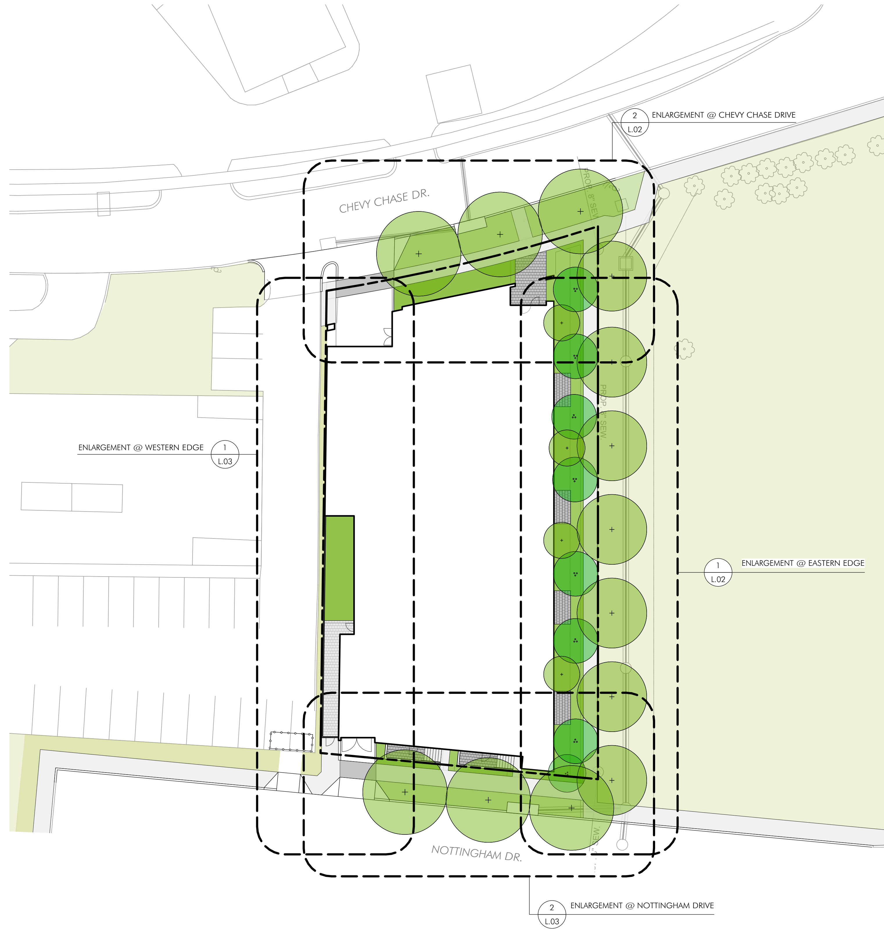
1 OVERALL LANDSCAPE PLAN Scale: 1" = 20'-0"