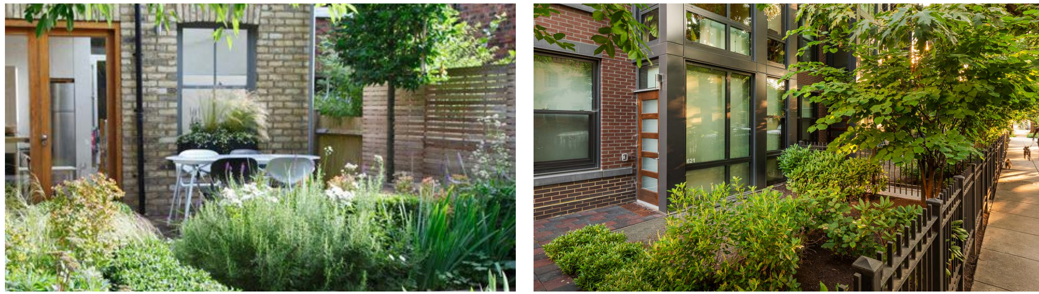
4 CHARACTER IMAGES - EASTERN EDGE