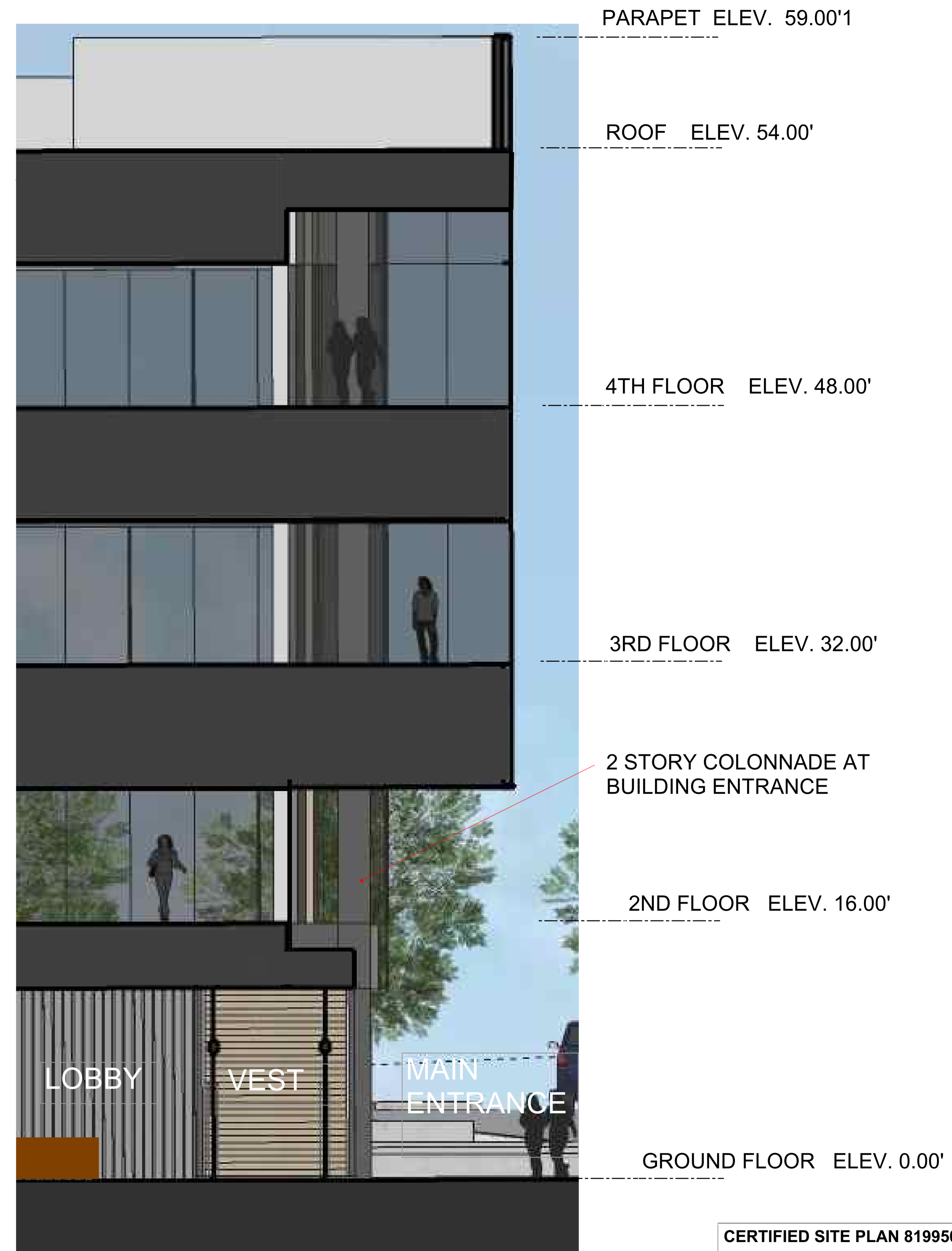
BUILDING E WALL SECTION AT MAIN ENTRANCE