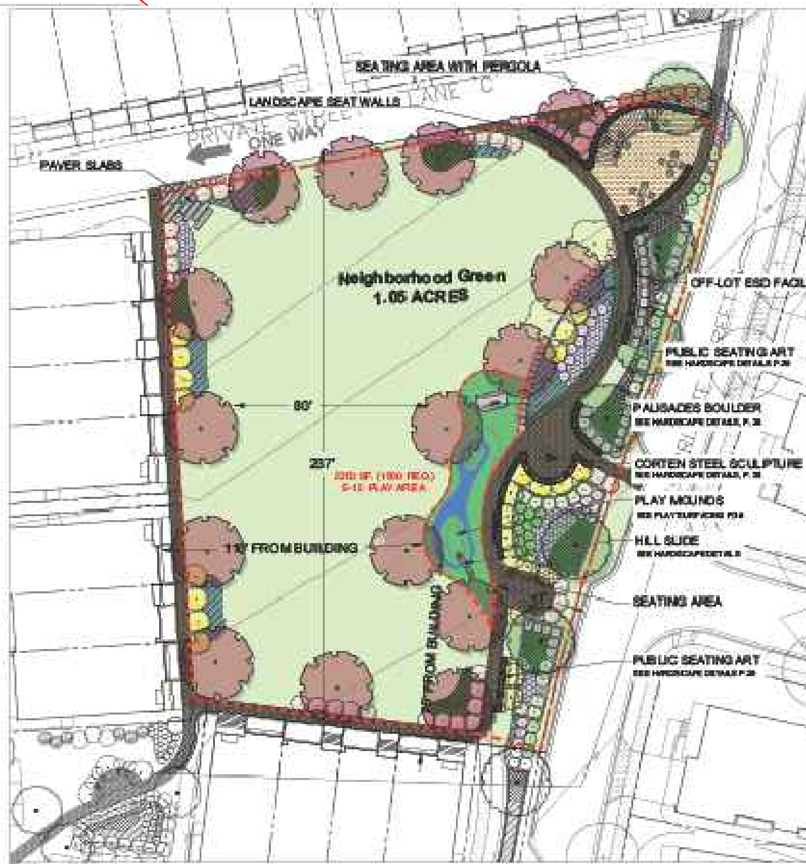
THE LAWN PLAY ENLARGEMENT