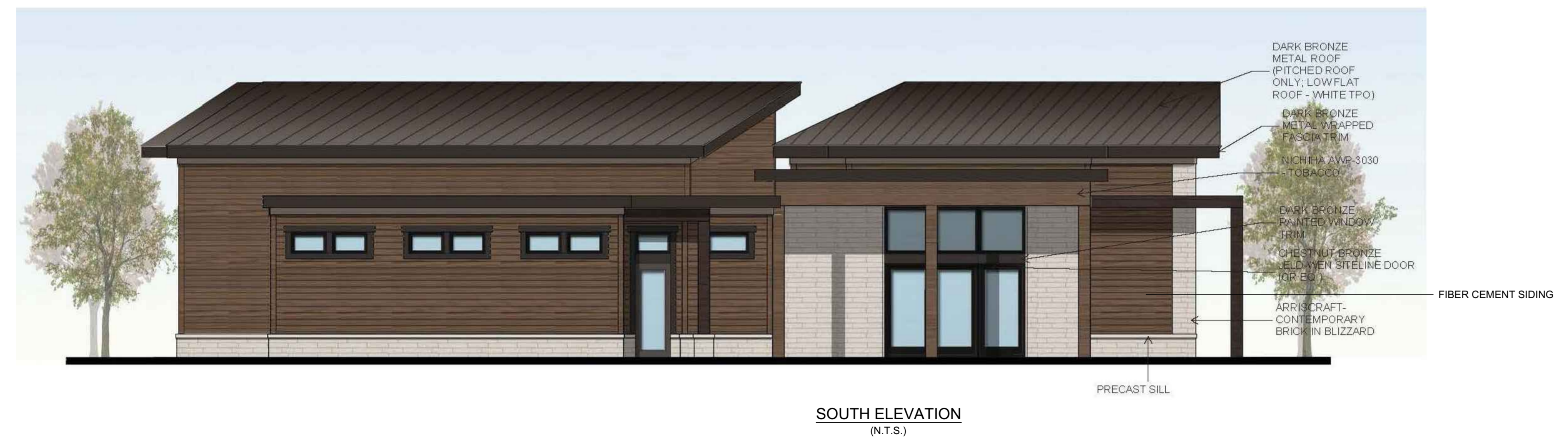
SOUTH ELEVATION (N.T.S.)