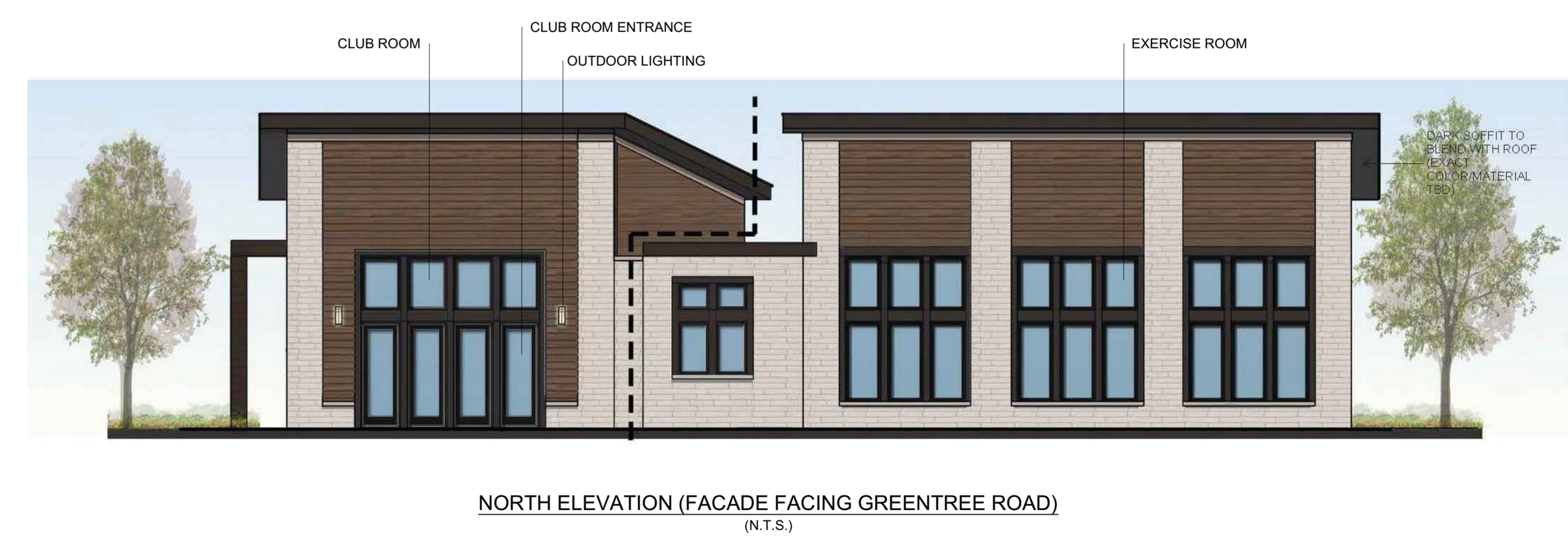
NORTH ELEVATION (FACADE FACING GREENTREE ROAD) (N.T.S.)