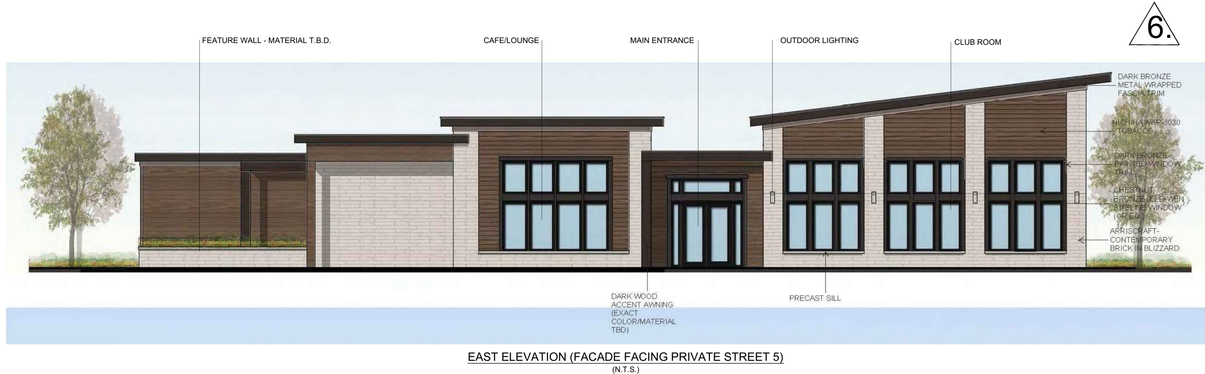
EAST ELEVATION (FACADE FACING PRIVATE STREET S) (N.T.S.)