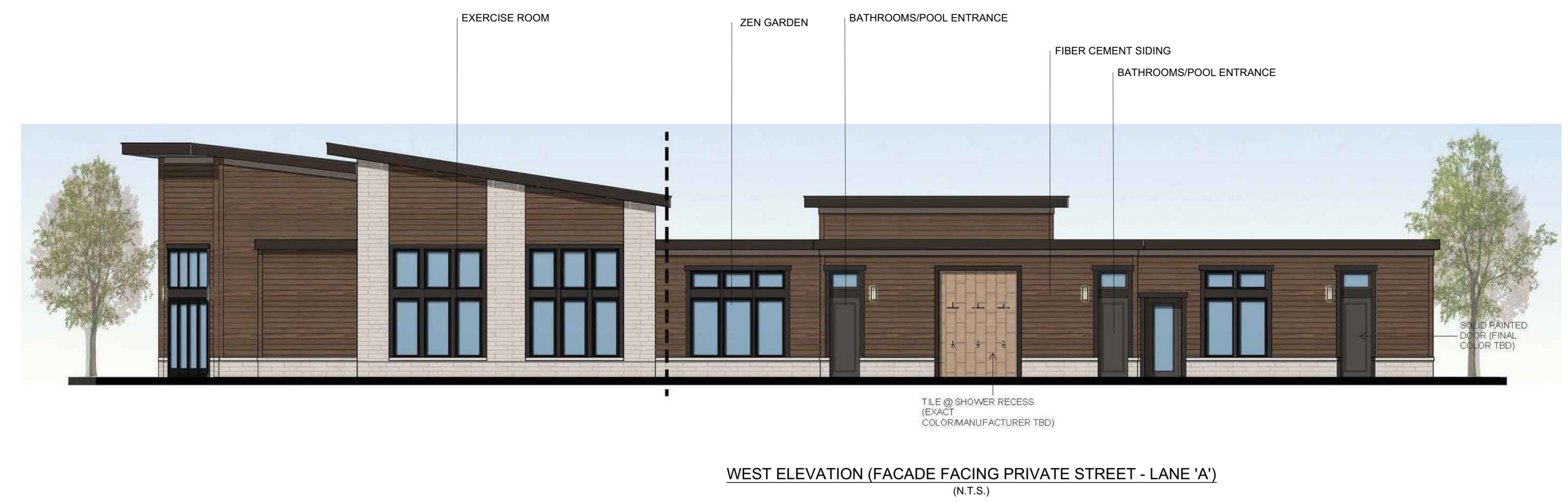
WEST ELEVATION (FACADE FACING PRIVATE STREET - LANE 'A') (N.T.S.)