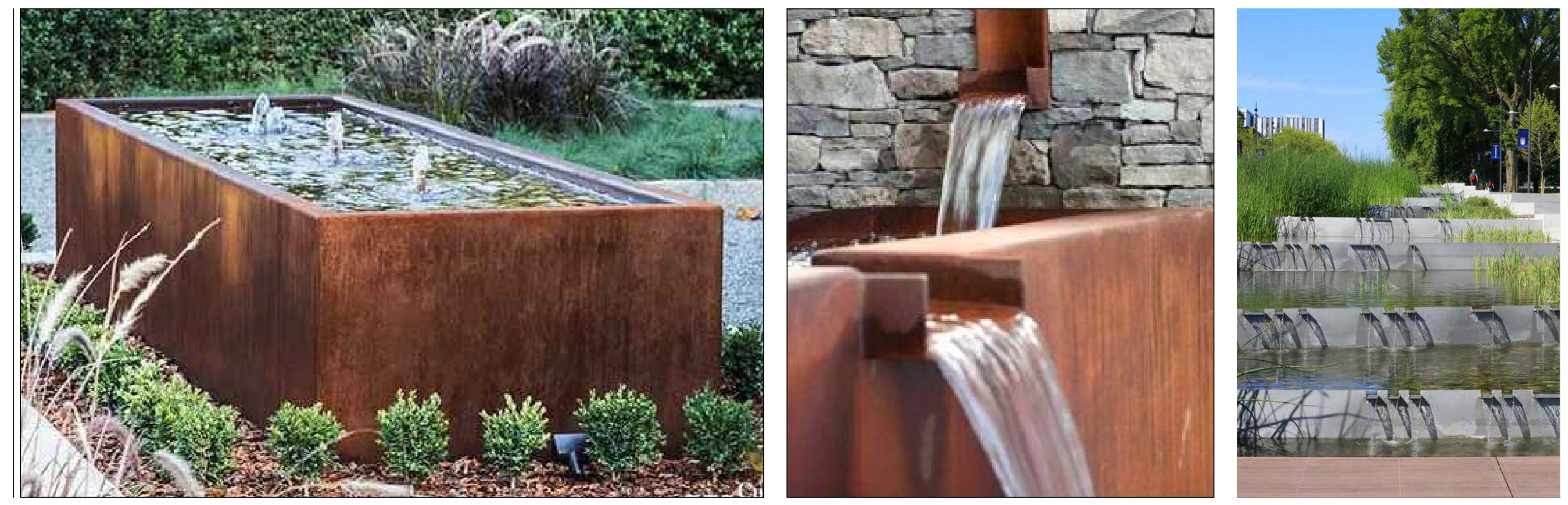
4 WATER FEATURE PRECEDENT IMAGES