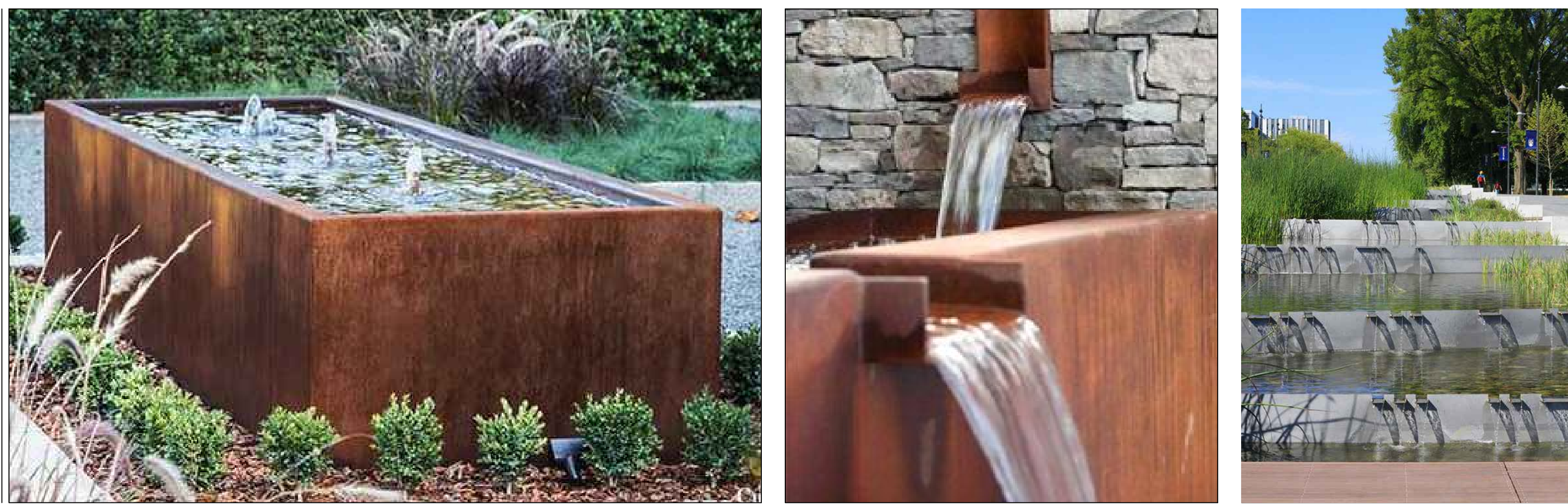
4 WATER FEATURE PRECEDENT IMAGES