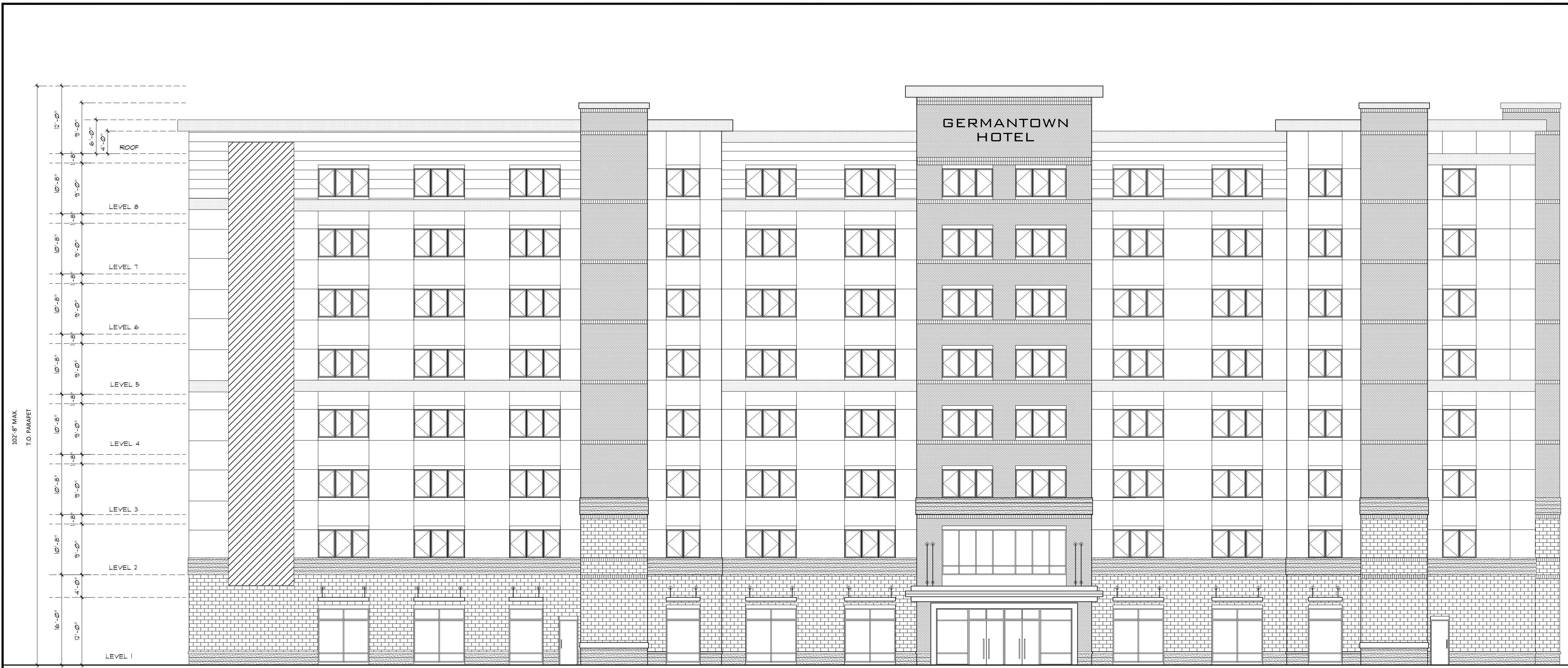
FRONT ELEVATION-WEST BLOCK

SCALE: 1/8" = 1'-0" 0 5 FEET 10 FEET 20 FEET