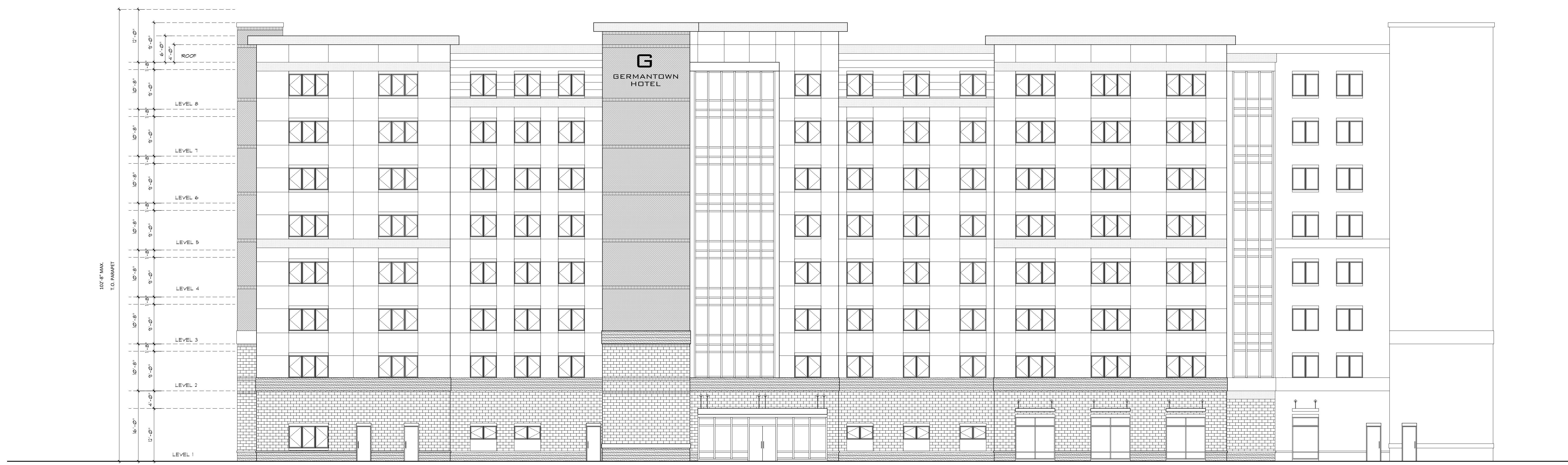
REAR ELEVATION- WEST BLOCK

SCALE: 1/8" = 1'-0" 0 5 FEET 10 FEET 20 FEET