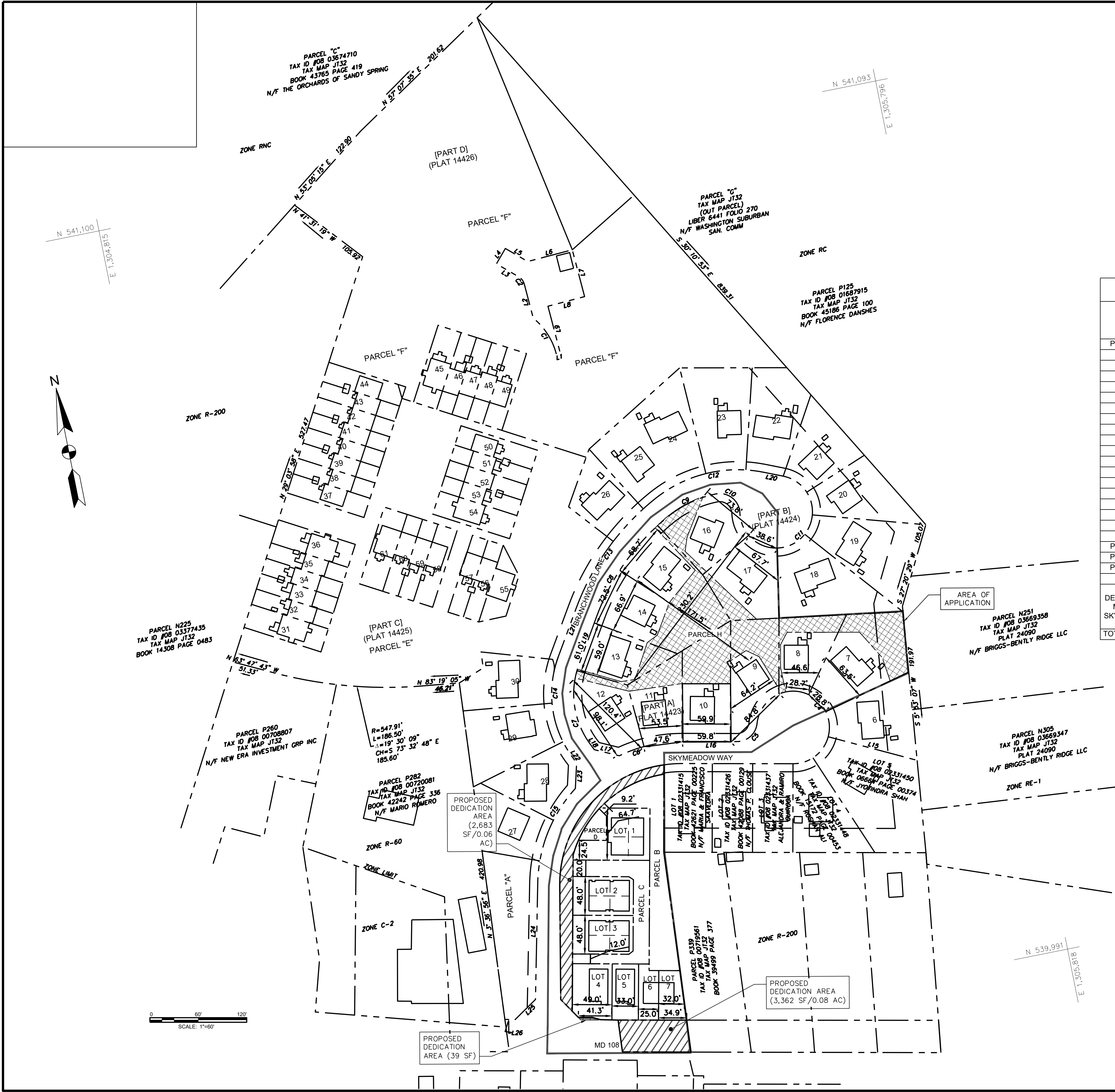
0 60' 120' SCALE: 1"=60'