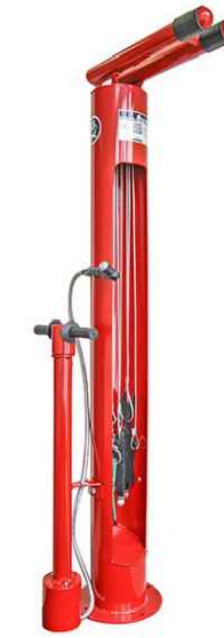
FIXIT Submittal Sheet