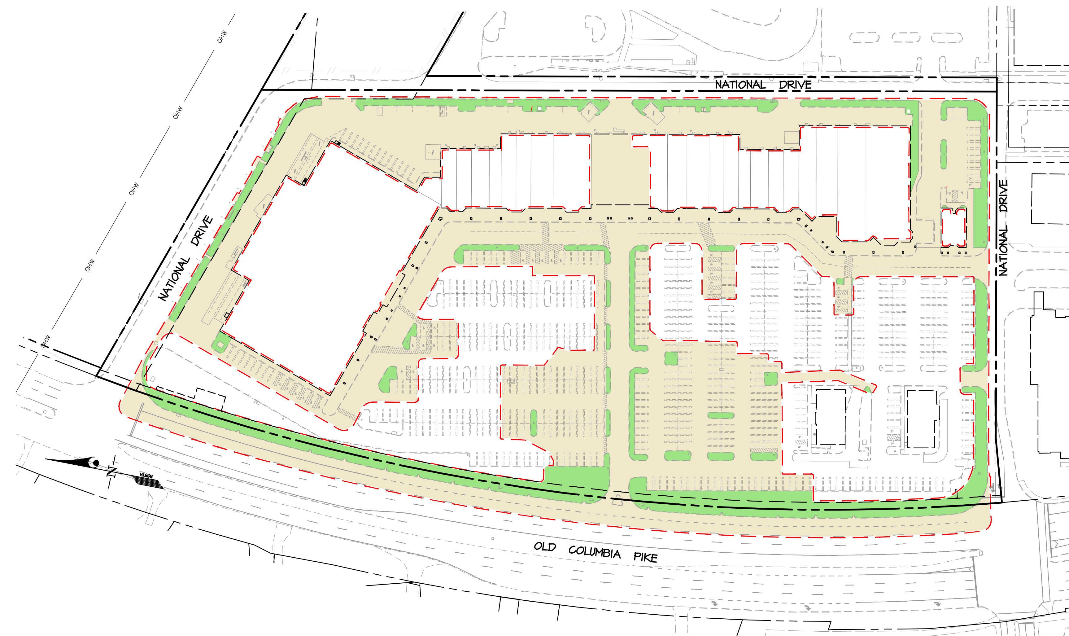
EXISTING IMPERVIOUS AREA 82% IMPERVIOUS AREA WITHIN LIMITS OF SITE PLAN 246,114 sf or 5.65 Ac.