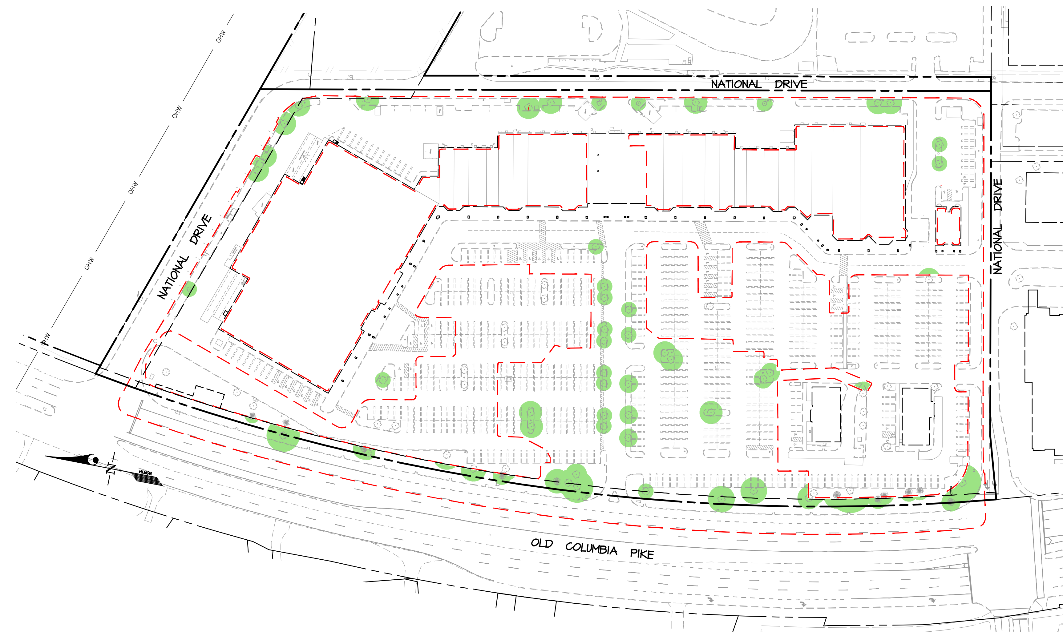
EXISTING TREE CANOPY COVERAGE 9% TREE CANOPY COVERAGE WITHIN LIMITS OF SITE PLAN 25,810 sf or 0.54 Ac.