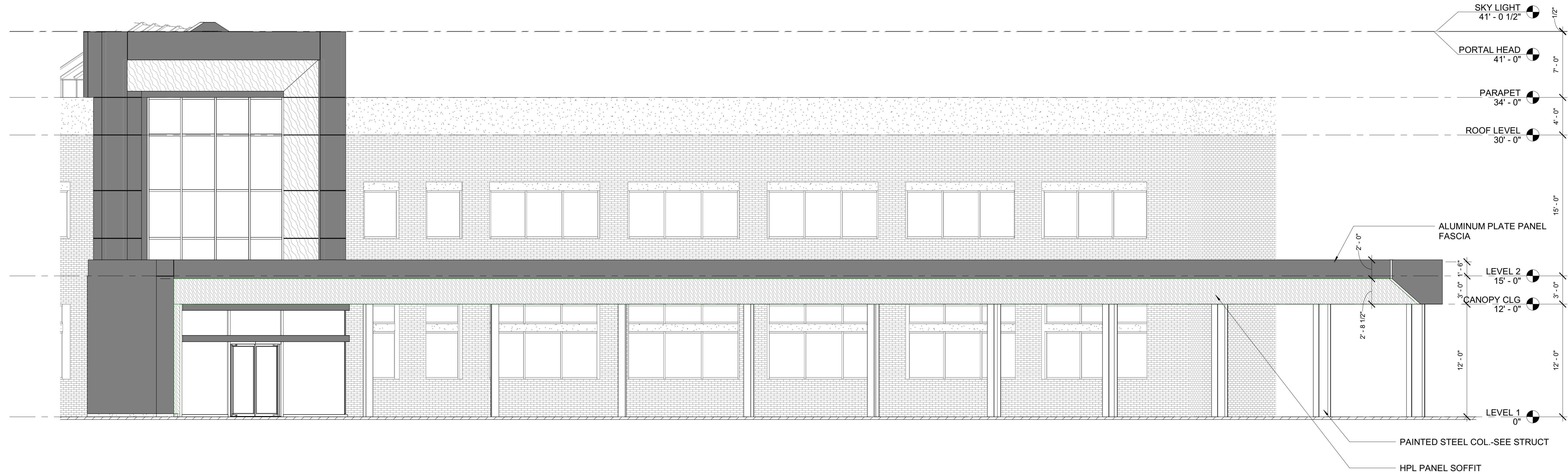
1 ELEVATION-CANOPY FRONT SCALE: 3/16" = 1'-0"