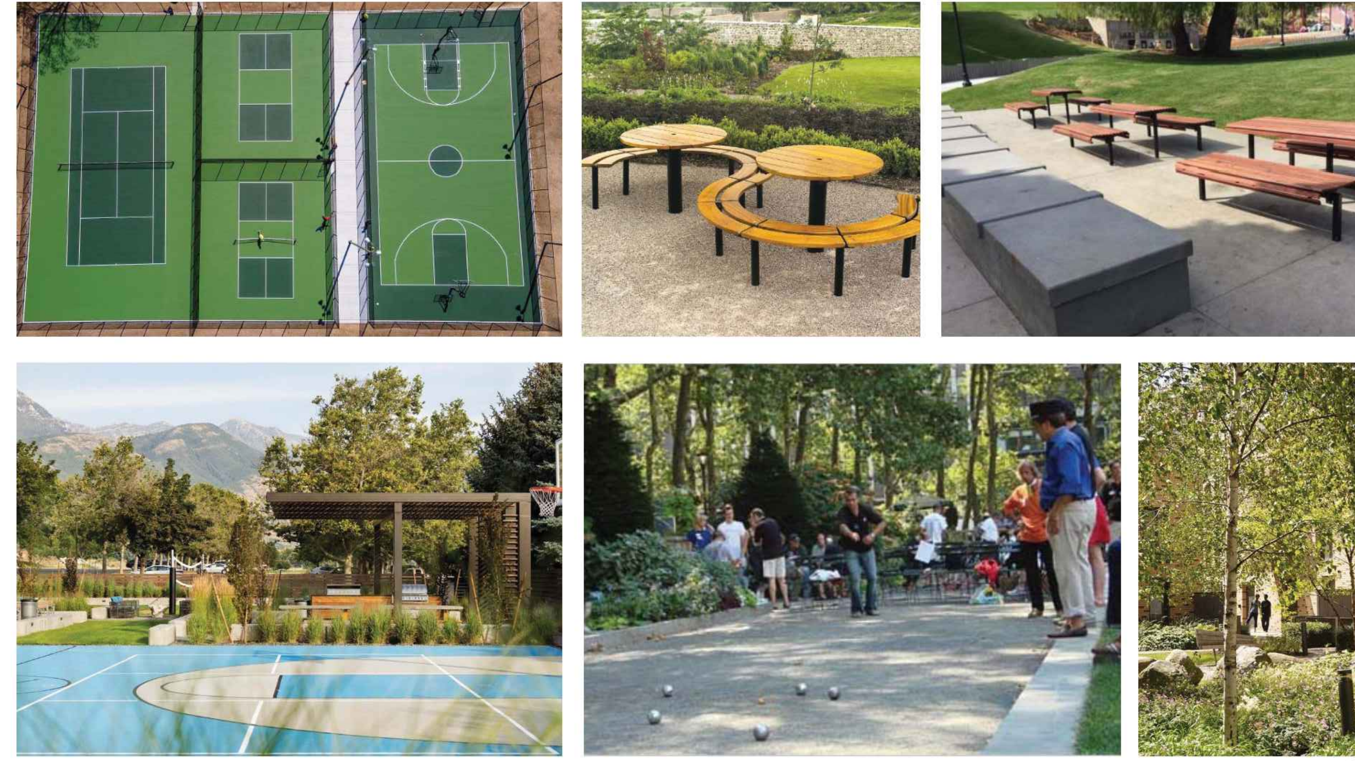
Democracy Center Bethesda | MD PRECEDENT IMAGERY ParkerRodriguez Date: 07-11-2023