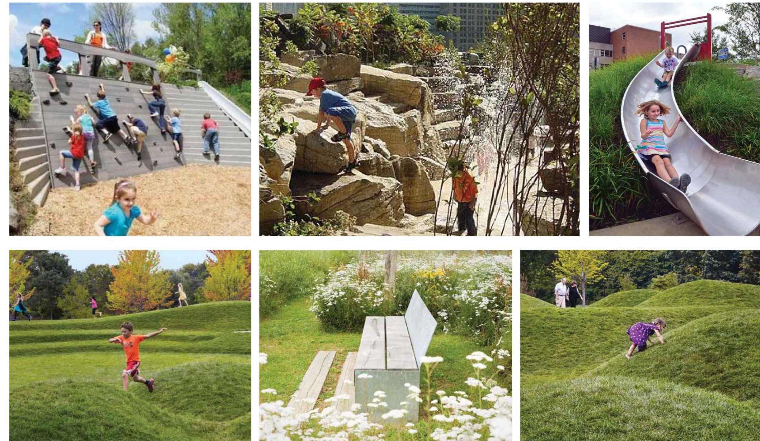
Democracy Center Bethesda | MD PRECEDENT IMAGERY ParkerRodriguez Date: 07-11-2023