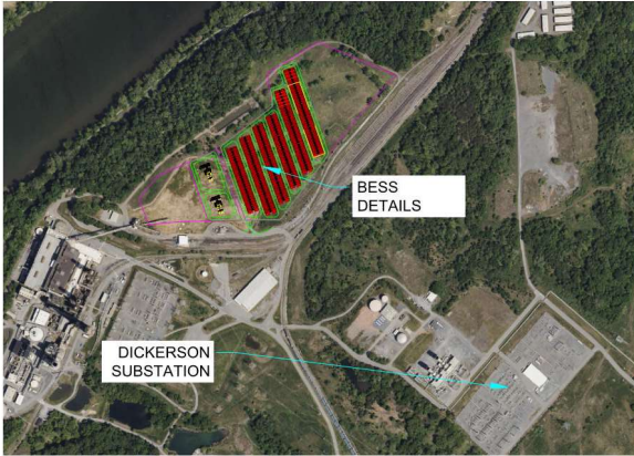
① SITE OVERVIEW SCALE: 1" = 100'