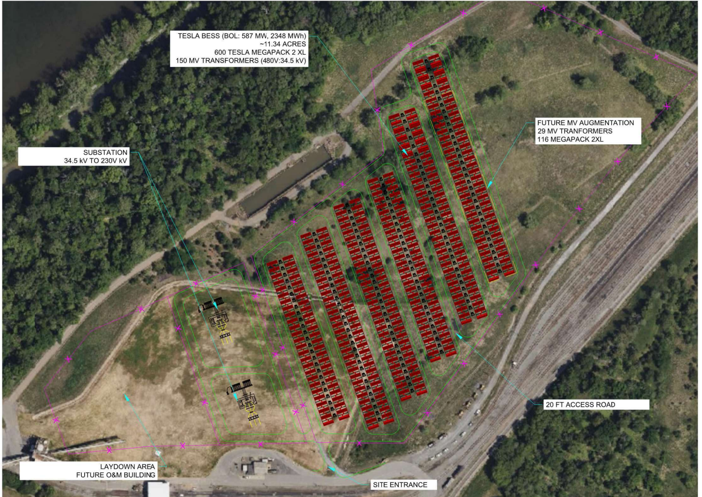
③ BESS DETAILS SCALE: 1" = 175'