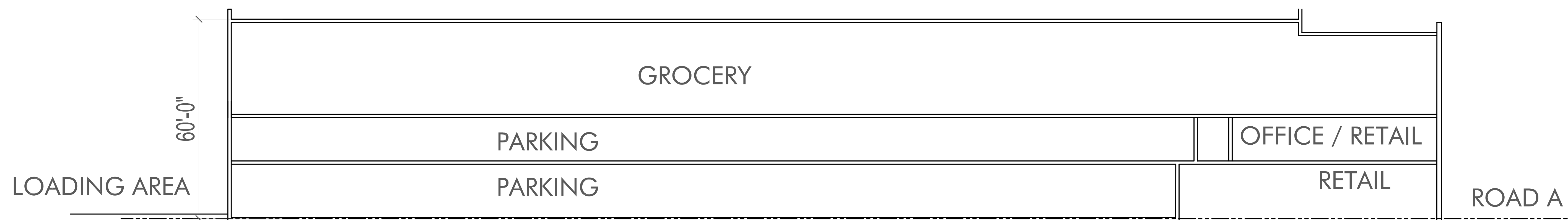
1 BUILDING SECTION