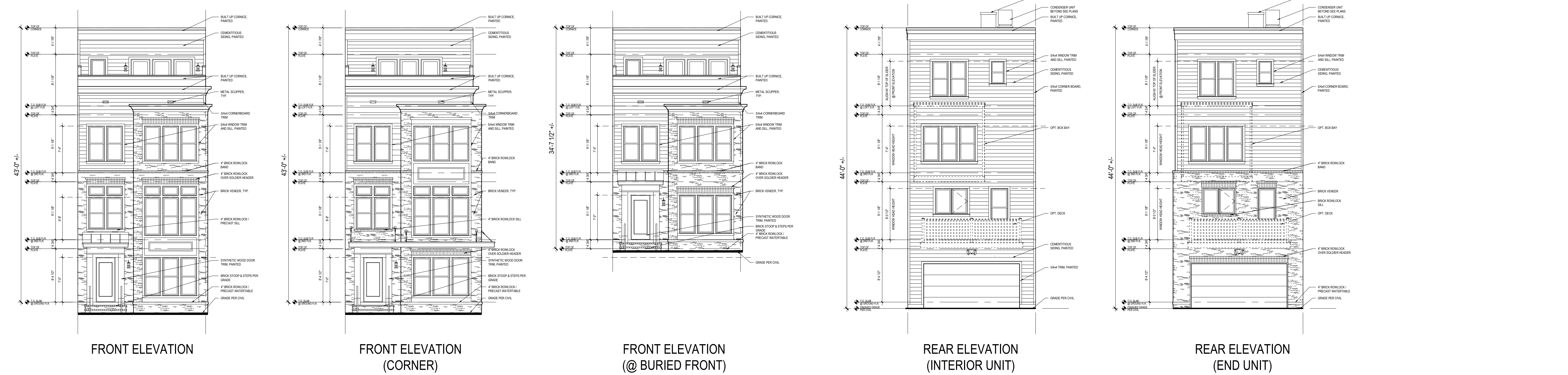
3 UNIT ELEVATIONS - C UNIT Scale: 1/8"=1'-0" REAR LOAD TOWNHOMES