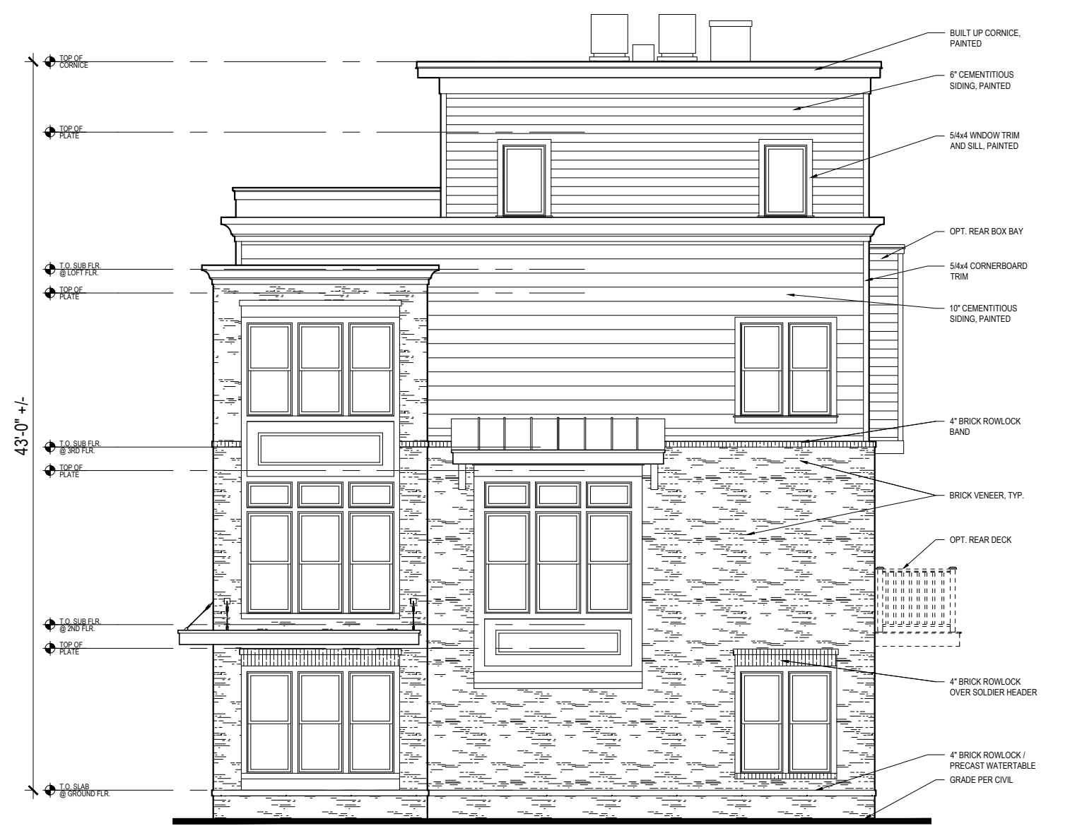
SIDE ELEVATION (CORNER)