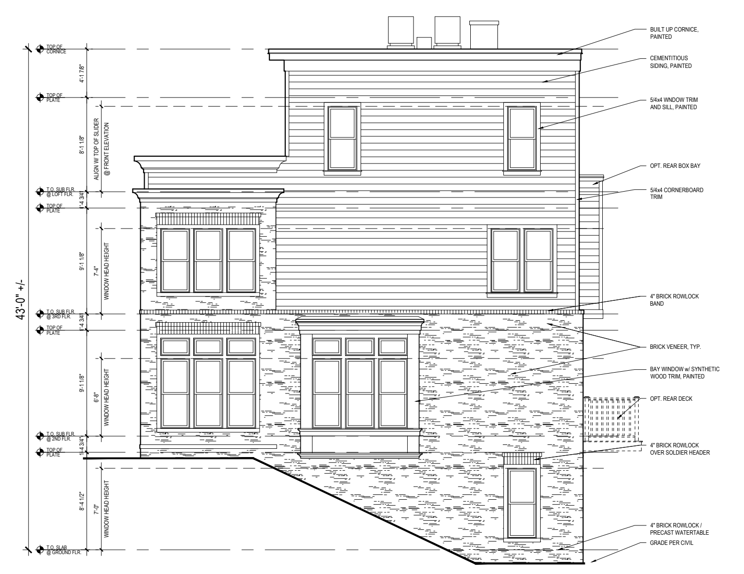
SIDE ELEVATION (ALT.) (@ BURIED FRONT)

2 UNIT ELEVATIONS - C UNIT Scale: 1/8"=1'-0" REAR LOAD TOWNHOMES