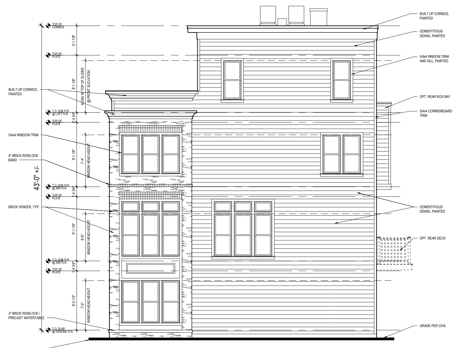
SIDE ELEVATION (STD.)

NOTE: FINAL BUILDING LOCATIONS, DIMENSIONS, HEIGHT, AND UNIT TYPE DESIGNATIONS TO BE DETERMINED AT TIME OF CERTIFIED SITE PLAN. THE PROPOSED ARCHITECTURAL DETAILS AND MATERIALS ARE CONCEPTUAL AND SUBJECT TO REVISION AT THE TIME OF CERTIFIED SITE PLAN.