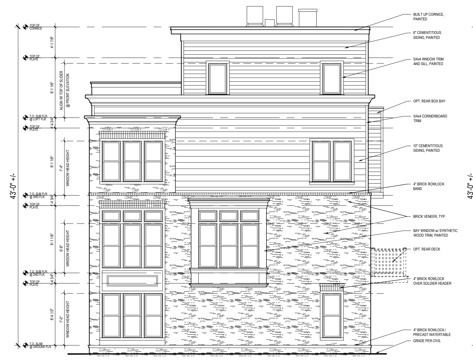
SIDE ELEVATION (ALT.)

1 UNIT ELEVATIONS - C UNIT Scale: 1/8"=1'-0" REAR LOAD TOWNHOMES