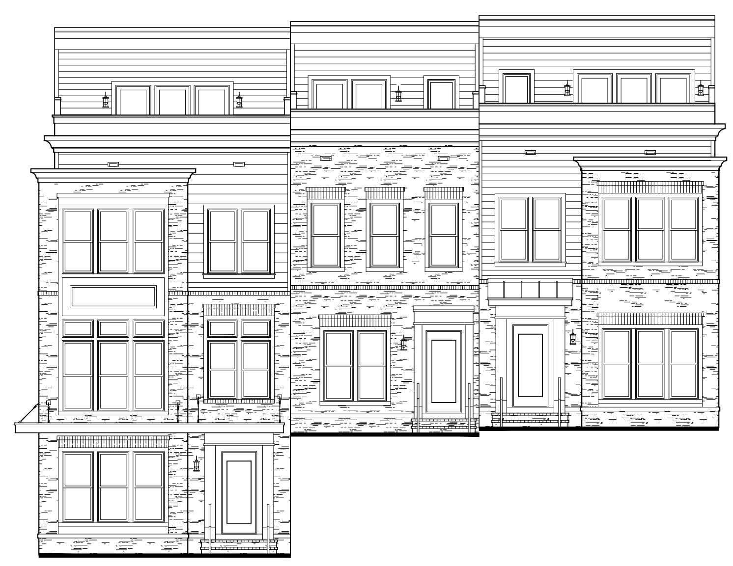
1 FRONT ELEVATION - BUILDING #1 A-310 Scale: 1/8"=1'-0"