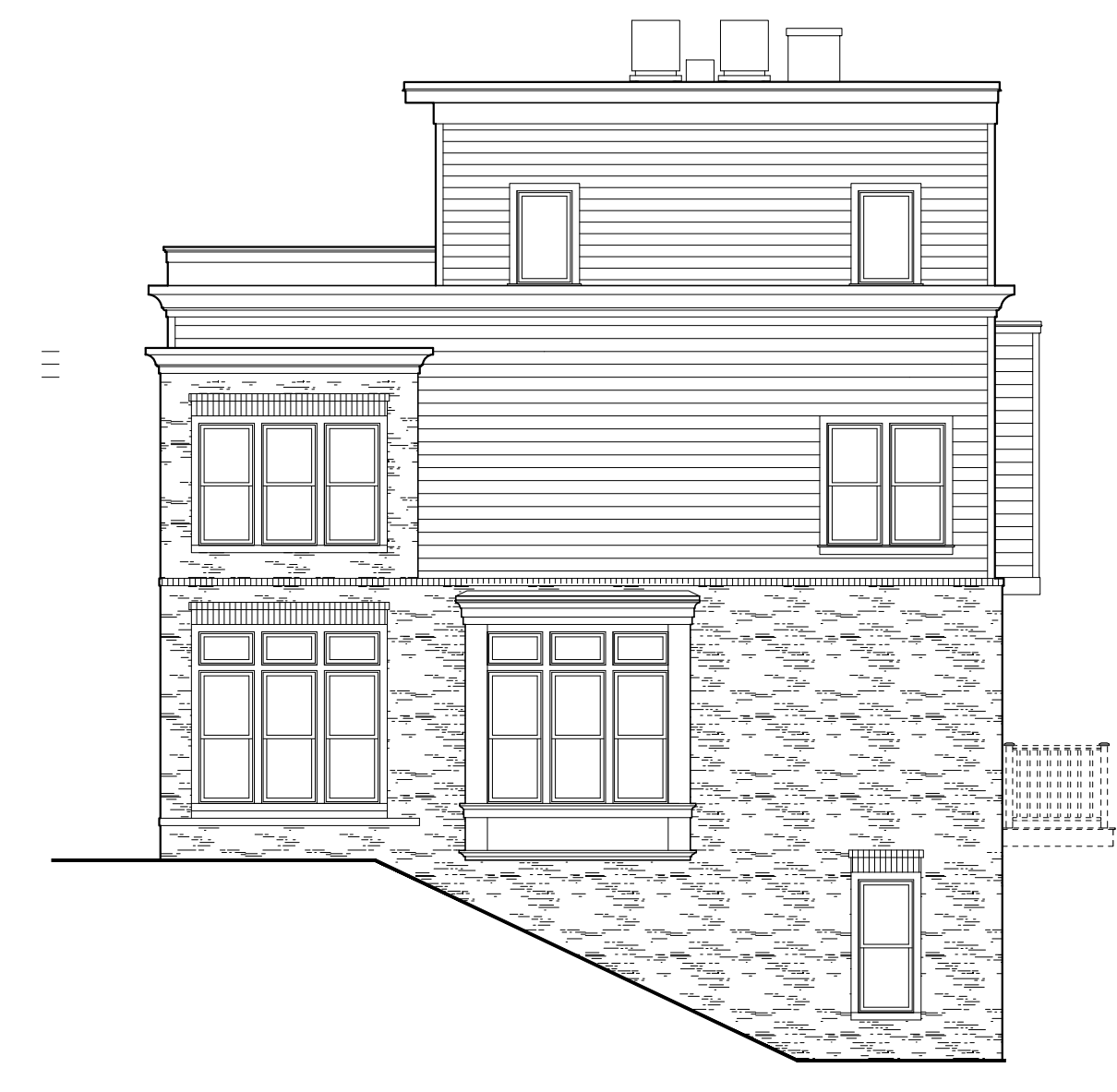
2 RIGHT SIDE ELEVATION - BUILDING #1 A-310 Scale: 1/8"=1'-0"