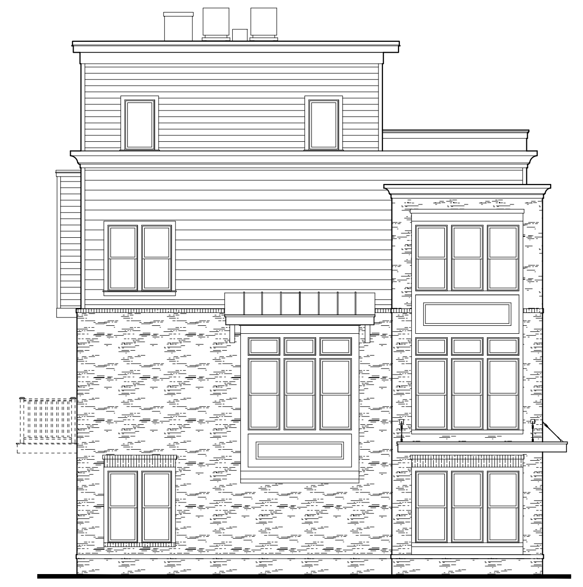
3 LEFT SIDE ELEVATION - BUILDING #1 A-310 Scale: 1/8"=1'-0"