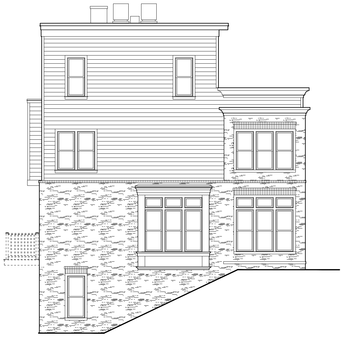
3 LEFT SIDE ELEVATION - BUILDING #2 A311 Scale: 1/8"=1'-0"