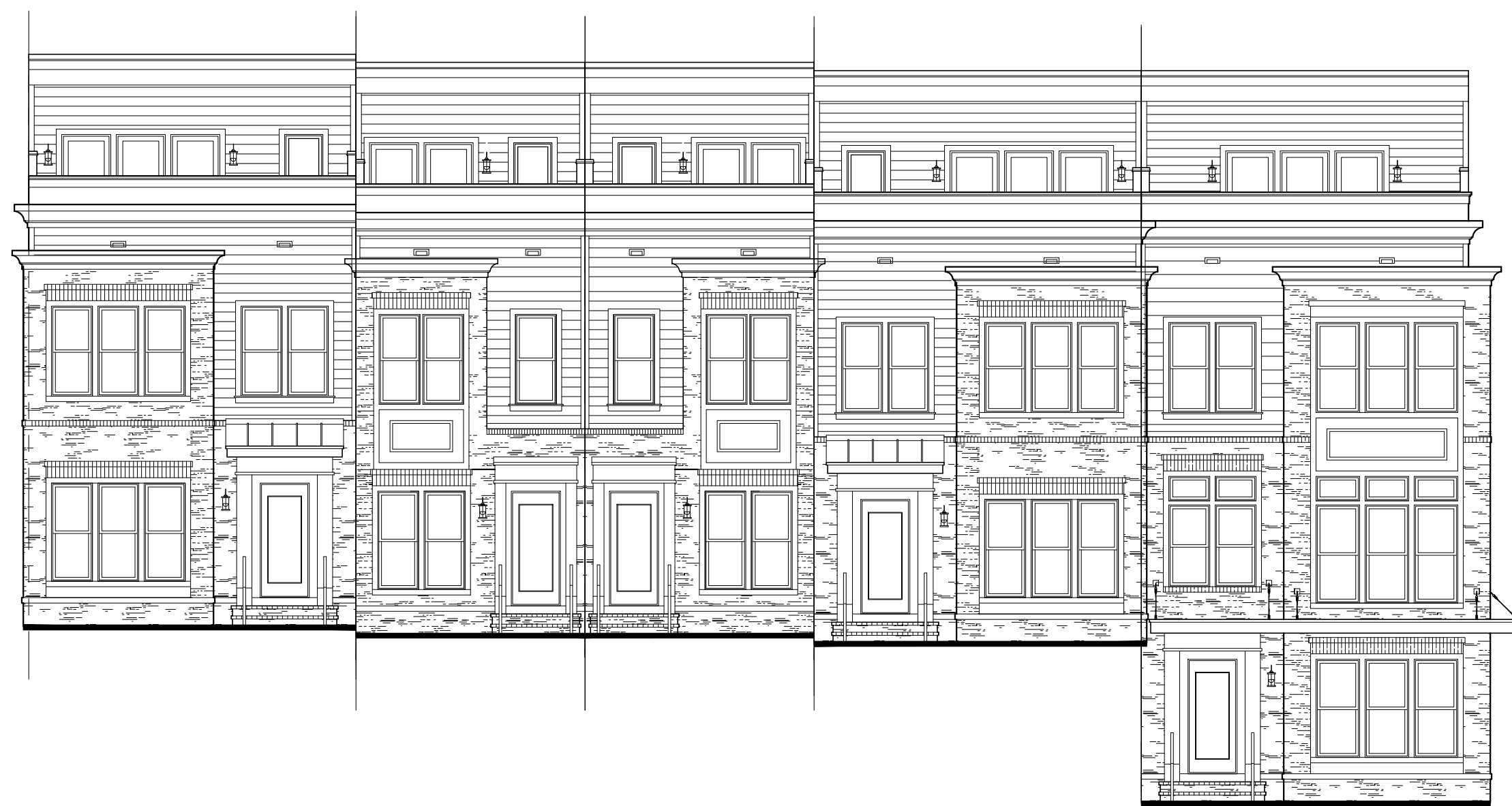
1 FRONT ELEVATION - BUILDING #2 A311 Scale: 1/8"=1'-0"