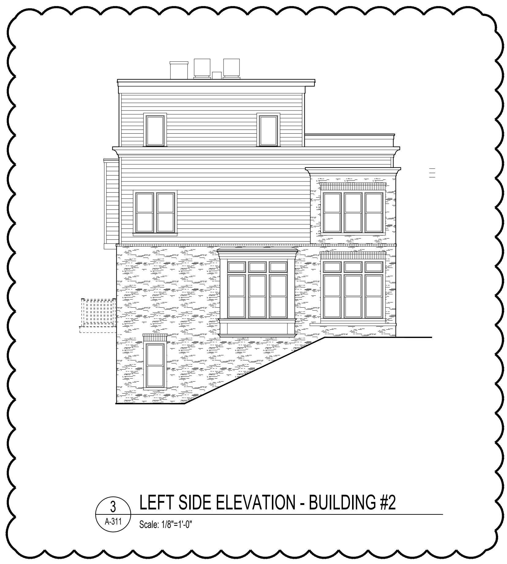
3 LEFT SIDE ELEVATION - BUILDING #2 Scale: 1/8"=1'-0"