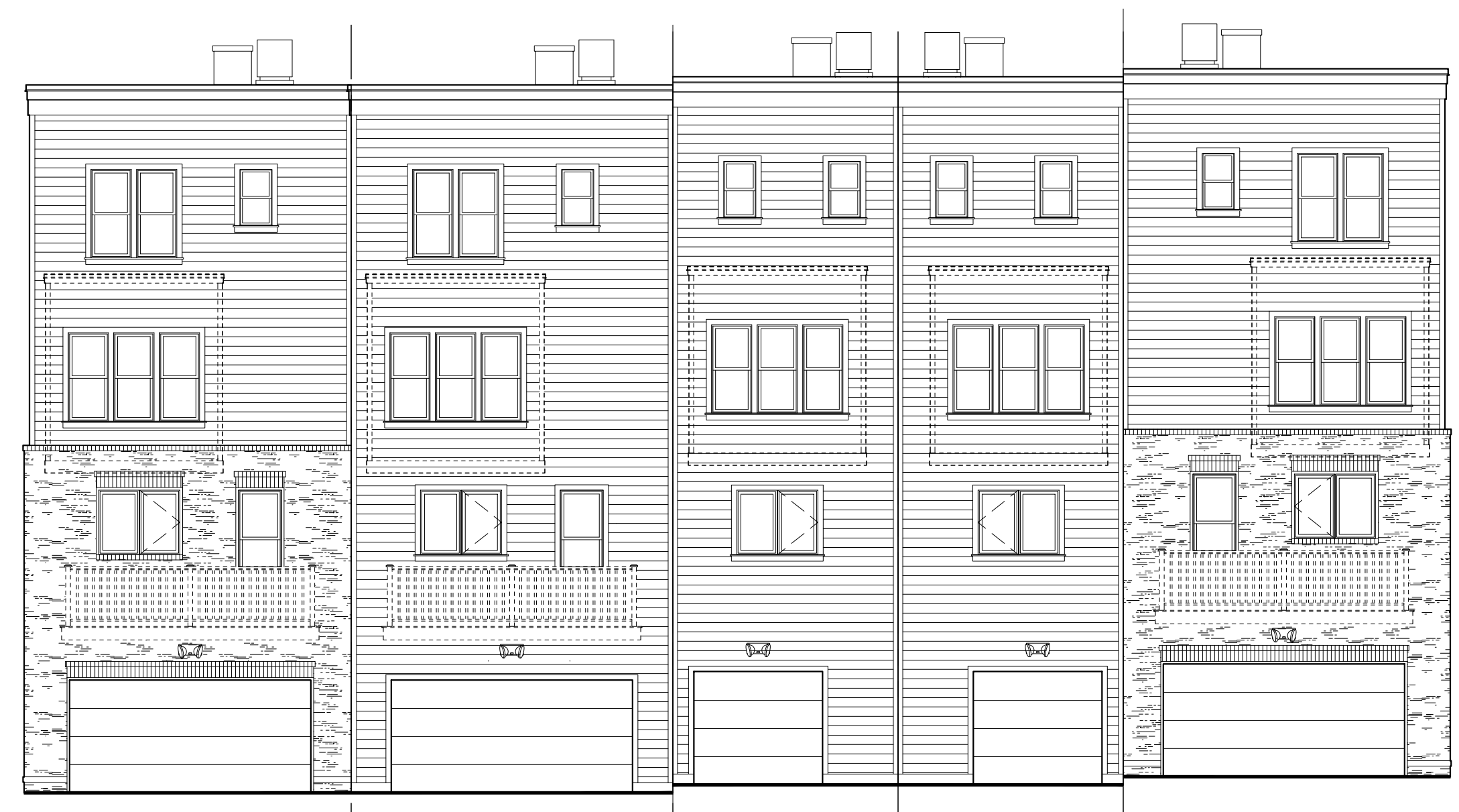
C UNIT C UNIT A UNIT (MPDU) A UNIT (MPDU) C UNIT