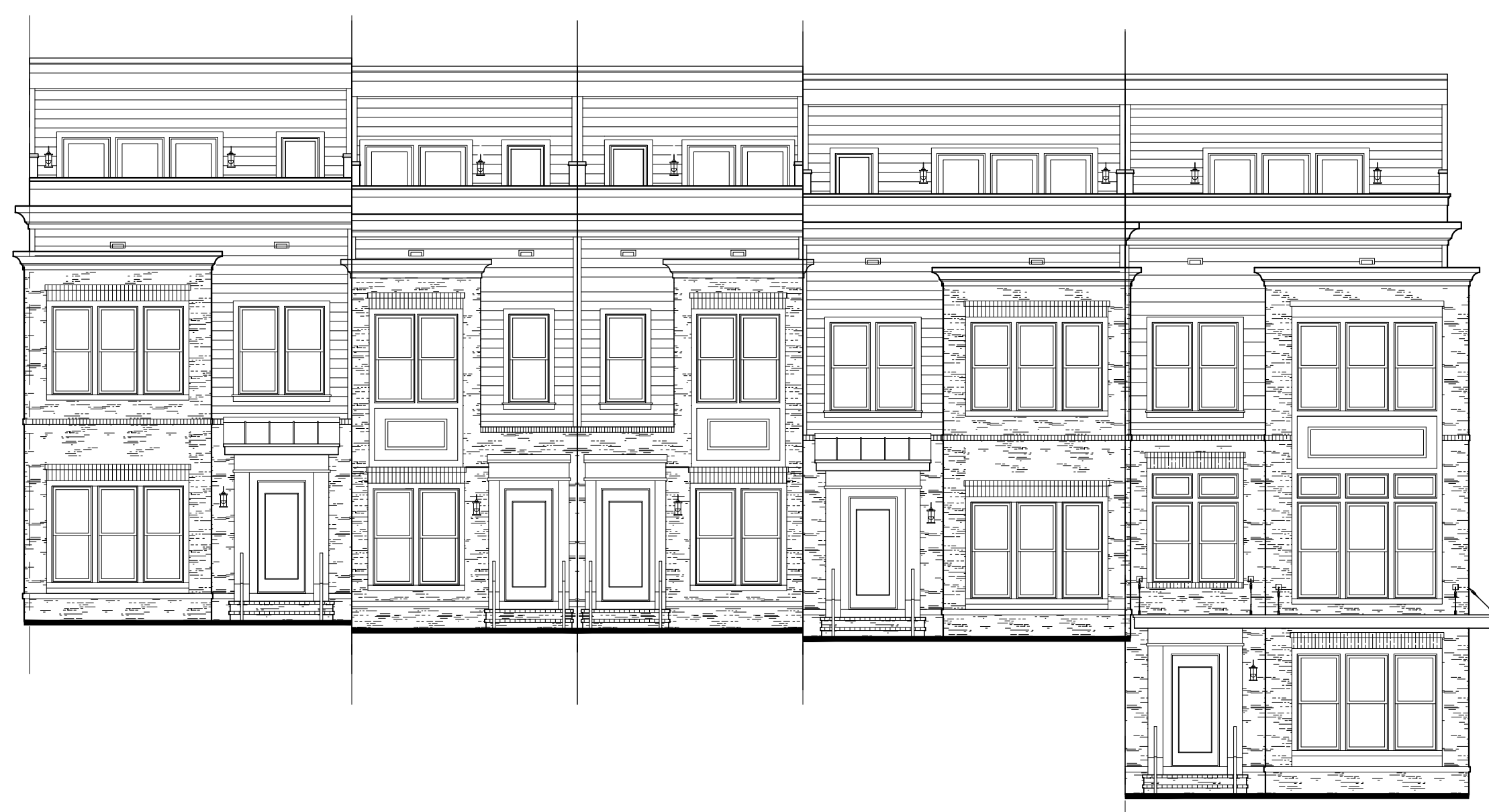
C UNIT A UNIT (MPDU) A UNIT (MPDU) C UNIT C UNIT