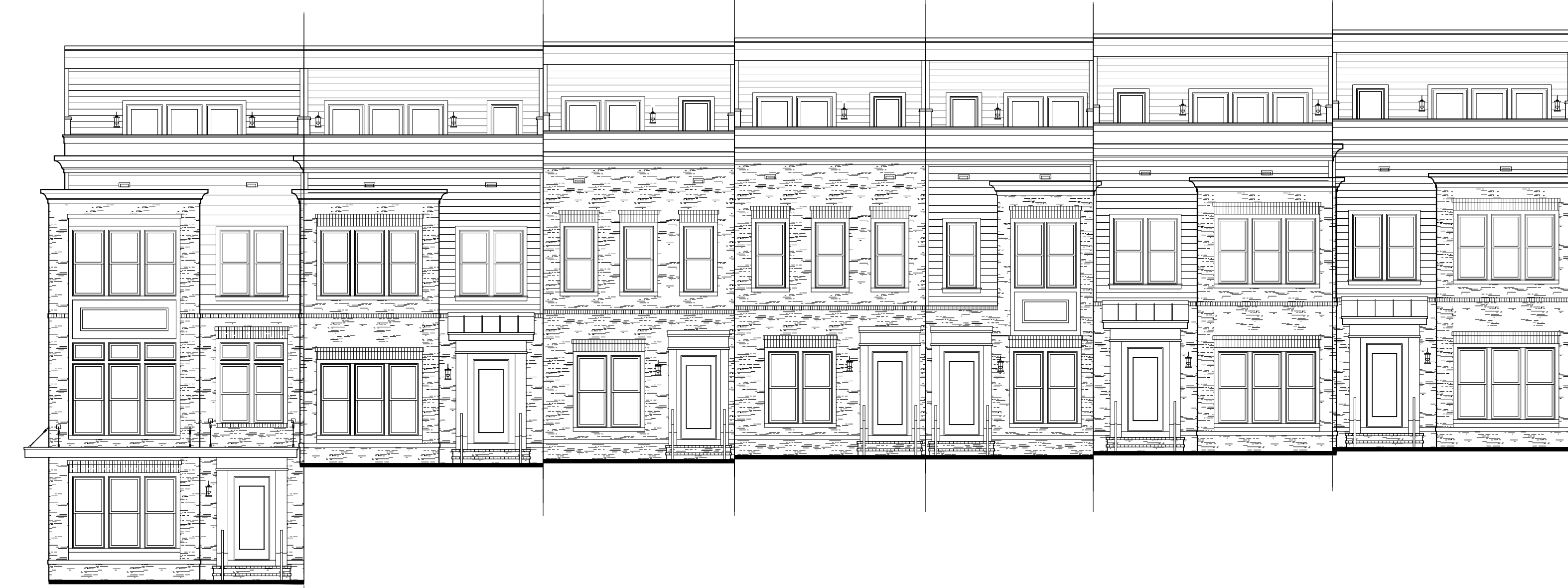
1 FRONT ELEVATION - BUILDING #3 A-312 Scale: 1/8"=1'-0"