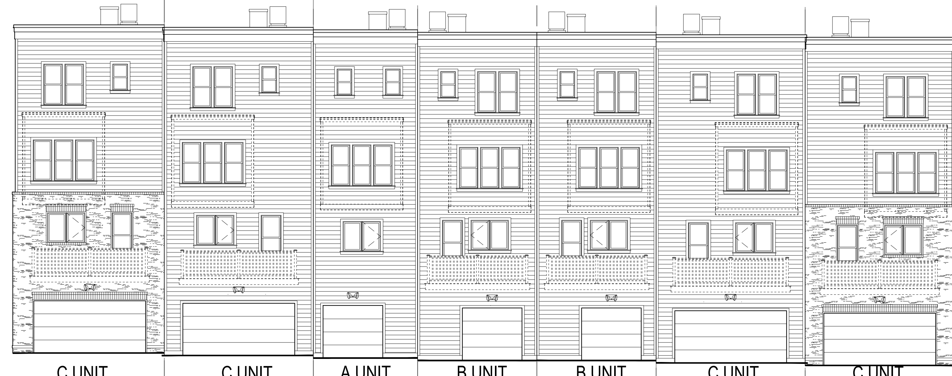
4 REAR ELEVATION - BUILDING #3 A-312 Scale: 1/8"=1'-0"

NOTE: FINAL BUILDING LOCATIONS, DIMENSIONS, HEIGHT, AND UNIT TYPE DESIGNATIONS TO BE DETERMINED AT TIME OF CERTIFIED SITE PLAN. THE PROPOSED ARCHITECTURAL DETAILS AND MATERIALS ARE CONCEPTUAL AND SUBJECT TO REVISION AT THE TIME OF CERTIFIED SITE PLAN.