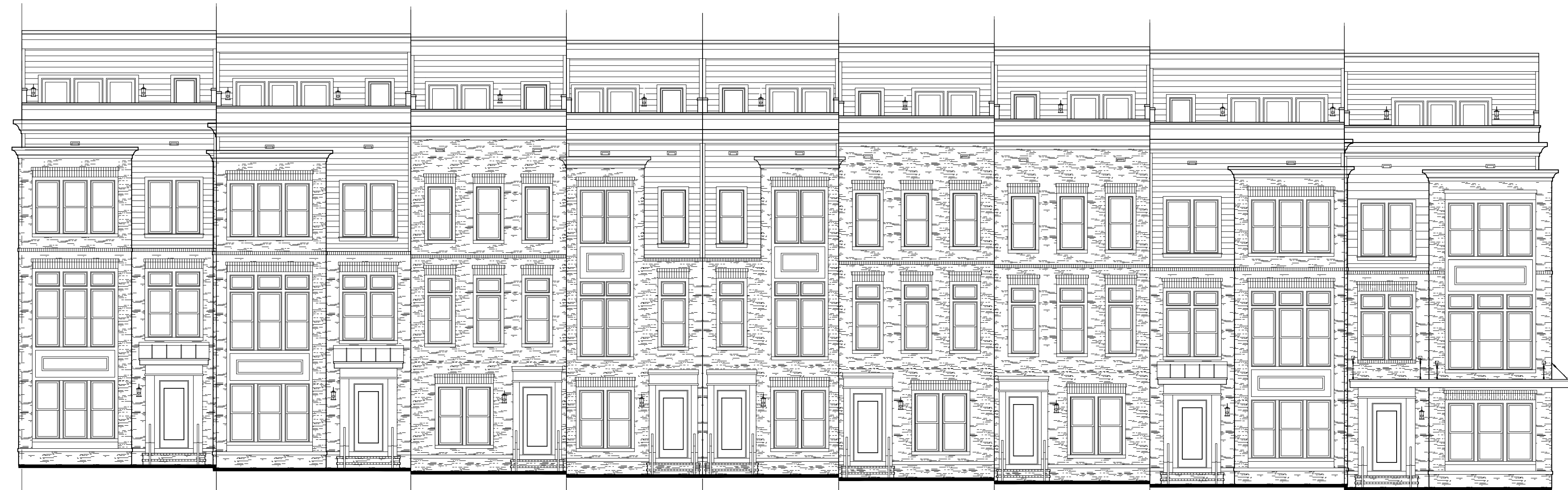
1 FRONT ELEVATION - BUILDING #4 Scale: 1/8"=1'-0"