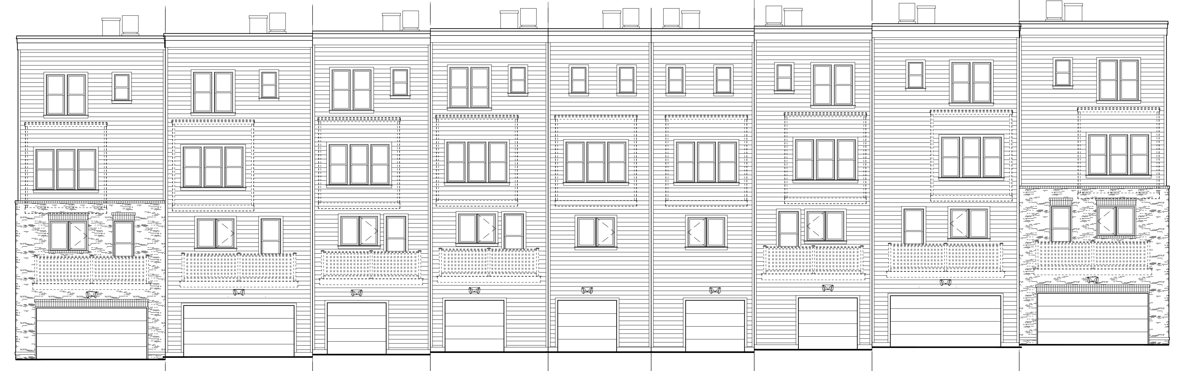
4 REAR ELEVATION - BUILDING #4 Scale: 1/8"=1'-0"

NOTE: FINAL BUILDING LOCATIONS, DIMENSIONS, HEIGHT, AND UNIT TYPE DESIGNATIONS TO BE DETERMINED AT TIME OF CERTIFIED SITE PLAN. THE PROPOSED ARCHITECTURAL DETAILS AND MATERIALS ARE CONCEPTUAL AND SUBJECT TO REVISION AT THE TIME OF CERTIFIED SITE PLAN.