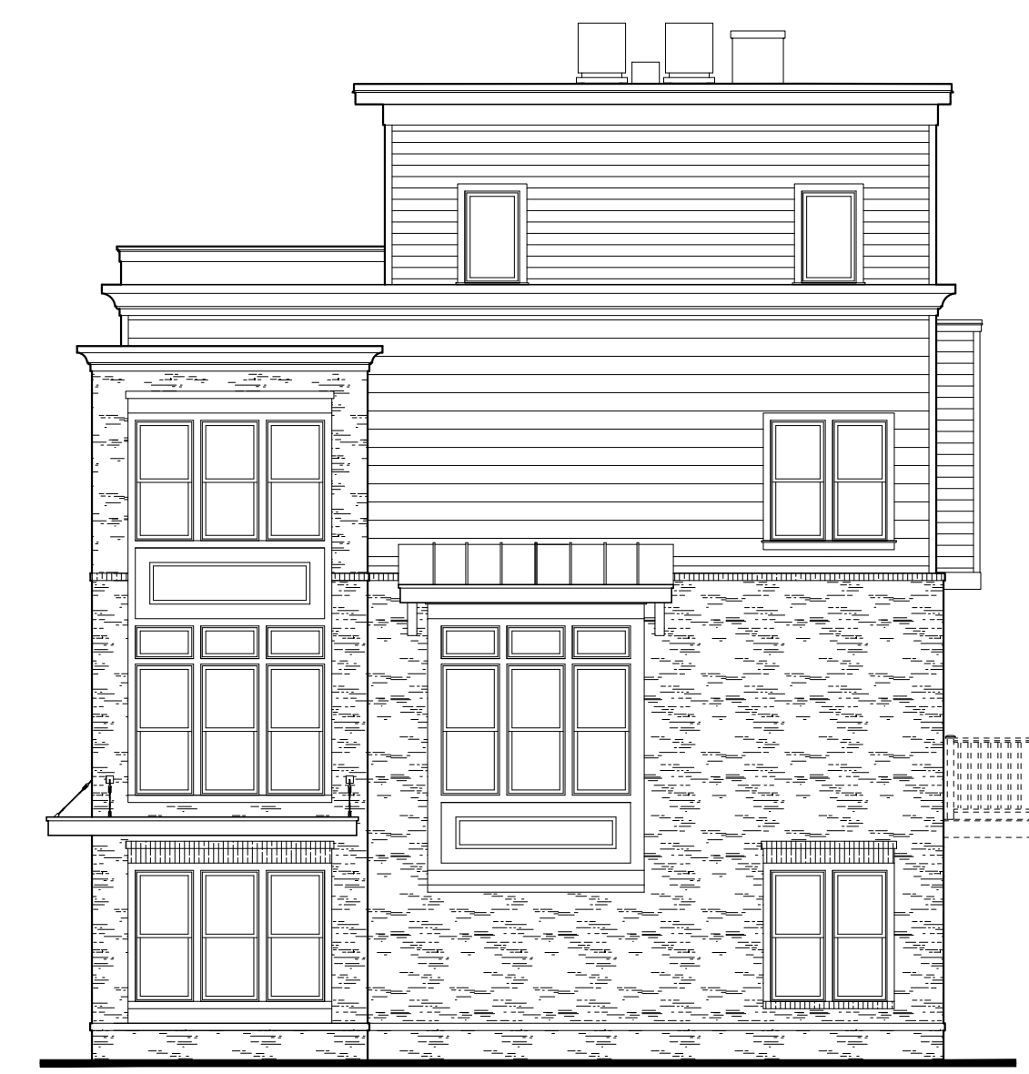
2 RIGHT SIDE ELEVATION - BUILDING #5 Scale: 1/8"=1'-0"