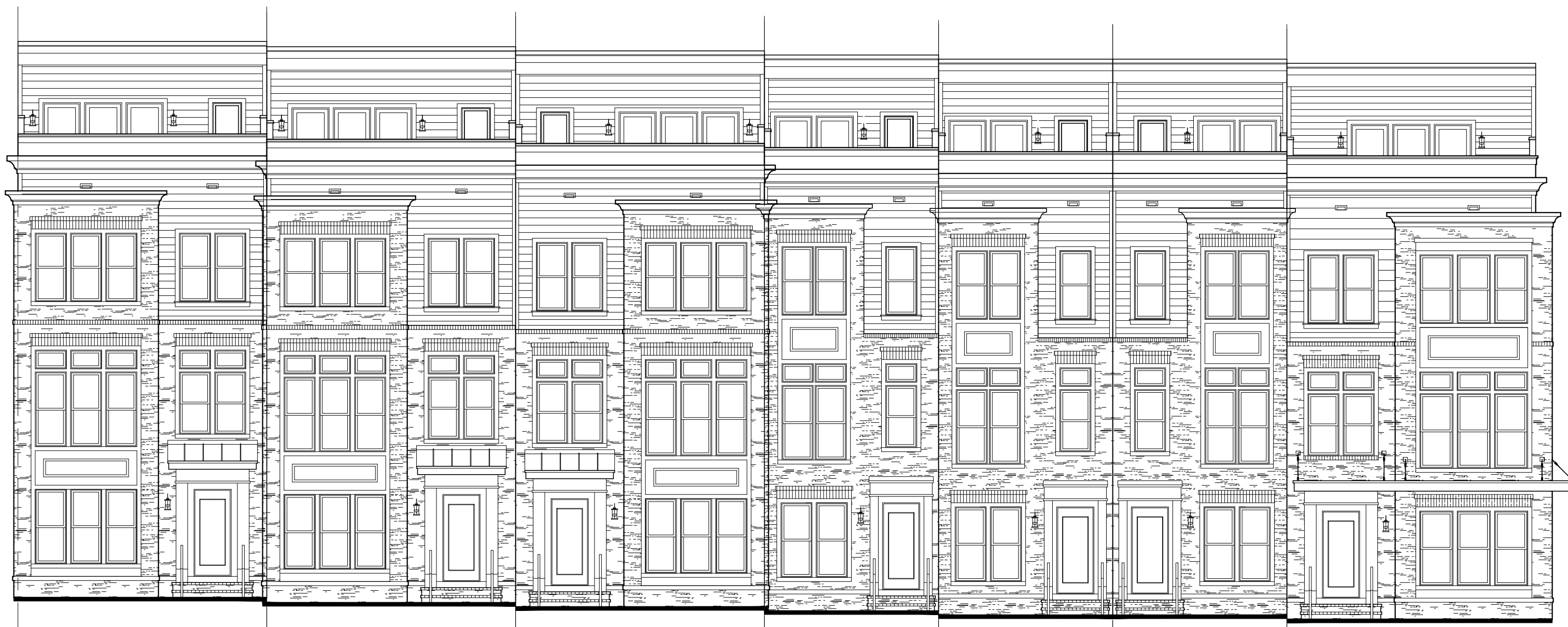
1 FRONT ELEVATION - BUILDING #5 Scale: 1/8"=1'-0"