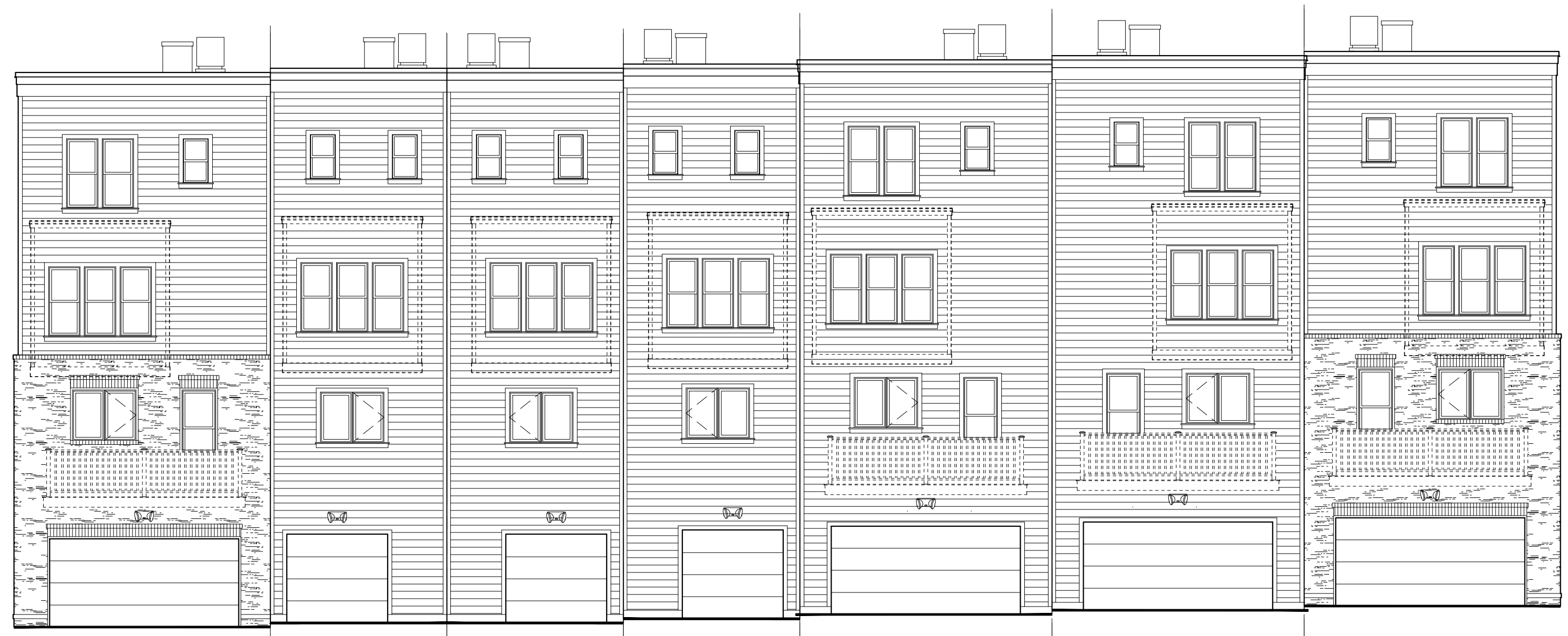
4 REAR ELEVATION - BUILDING #5 Scale: 1/8"=1'-0"

NOTE: FINAL BUILDING LOCATIONS, DIMENSIONS, HEIGHT, AND UNIT TYPE DESIGNATIONS TO BE DETERMINED AT TIME OF CERTIFIED SITE PLAN. THE PROPOSED ARCHITECTURAL DETAILS AND MATERIALS ARE CONCEPTUAL AND SUBJECT TO REVISION AT THE TIME OF CERTIFIED SITE PLAN.