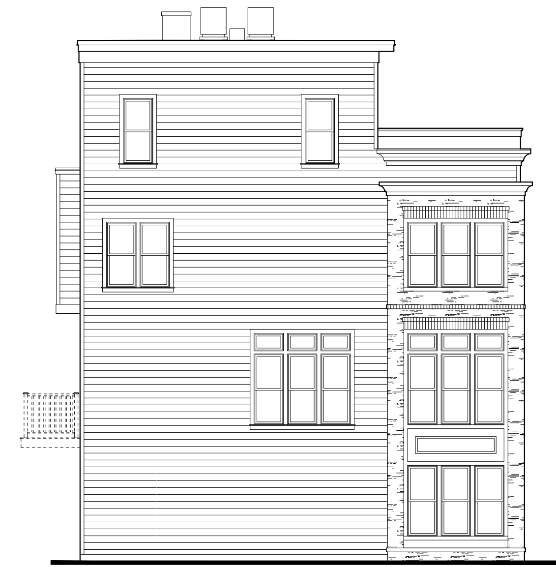
3 LEFT SIDE ELEVATION - BUILDING #5 Scale: 1/8"=1'-0"