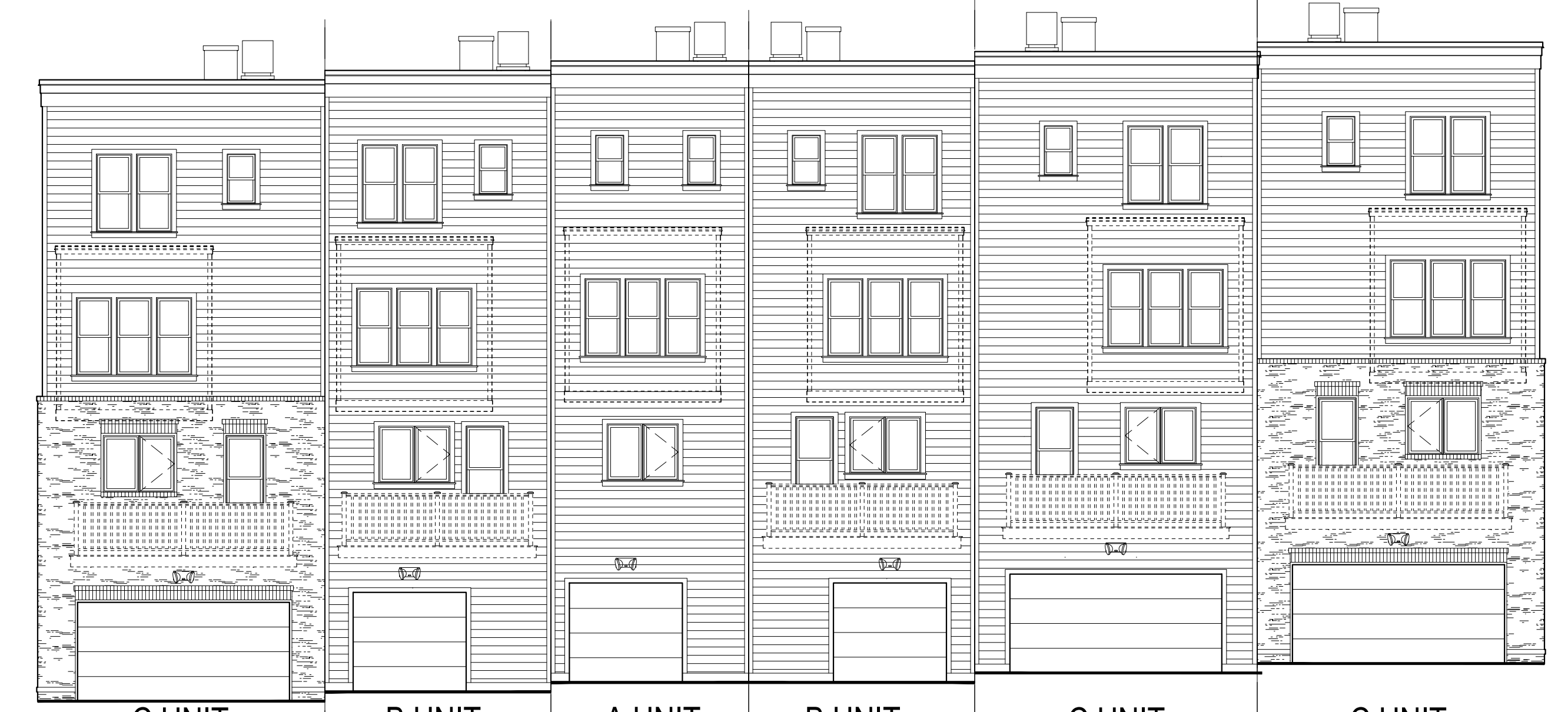
4 REAR ELEVATION - BUILDING #6 Scale: 1/8"=1'-0"

NOTE: FINAL BUILDING LOCATIONS, DIMENSIONS, HEIGHT, AND UNIT TYPE DESIGNATIONS TO BE DETERMINED AT TIME OF CERTIFIED SITE PLAN. THE PROPOSED ARCHITECTURAL DETAILS AND MATERIALS ARE CONCEPTUAL AND SUBJECT TO REVISION AT THE TIME OF CERTIFIED SITE PLAN.