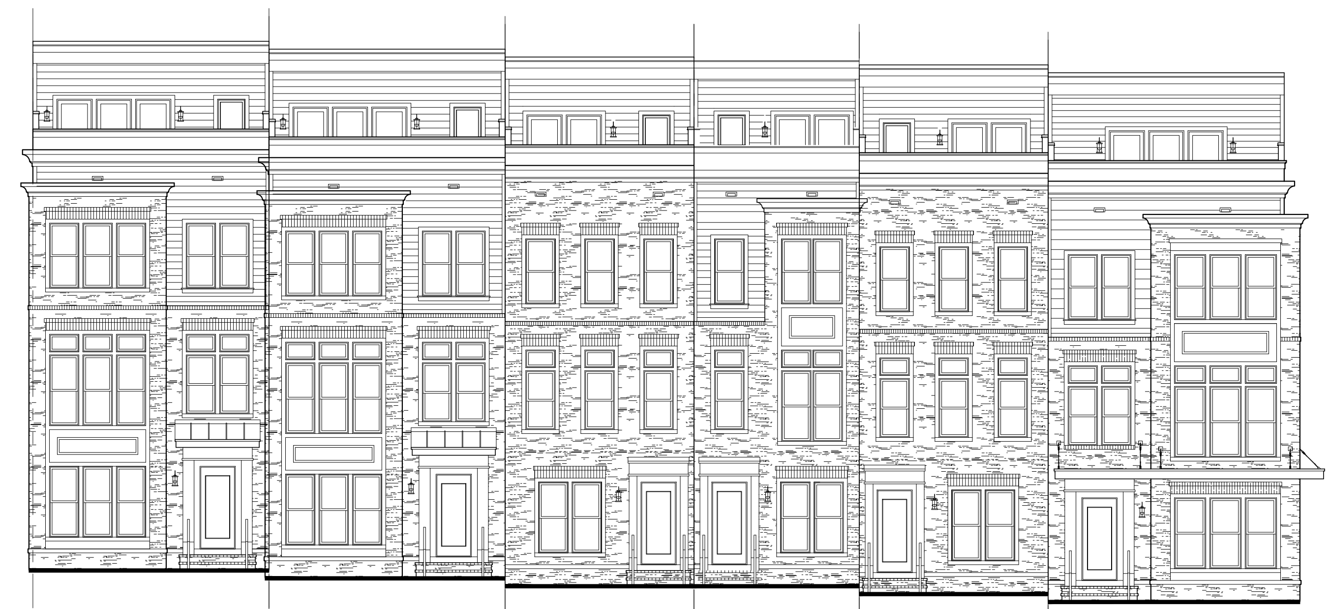
1 FRONT ELEVATION - BUILDING #6 Scale: 1/8"=1'-0"