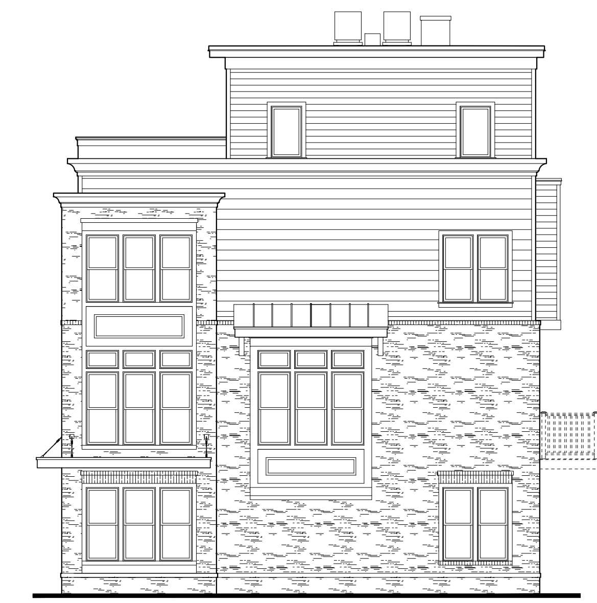
2 RIGHT SIDE ELEVATION - BUILDING #6 Scale: 1/8"=1'-0"