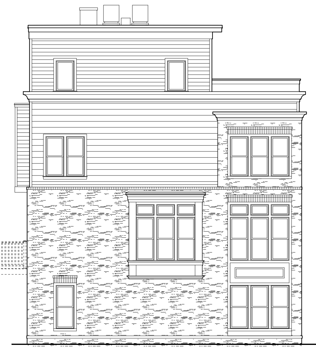
3 LEFT SIDE ELEVATION - BUILDING #6 Scale: 1/8"=1'-0"