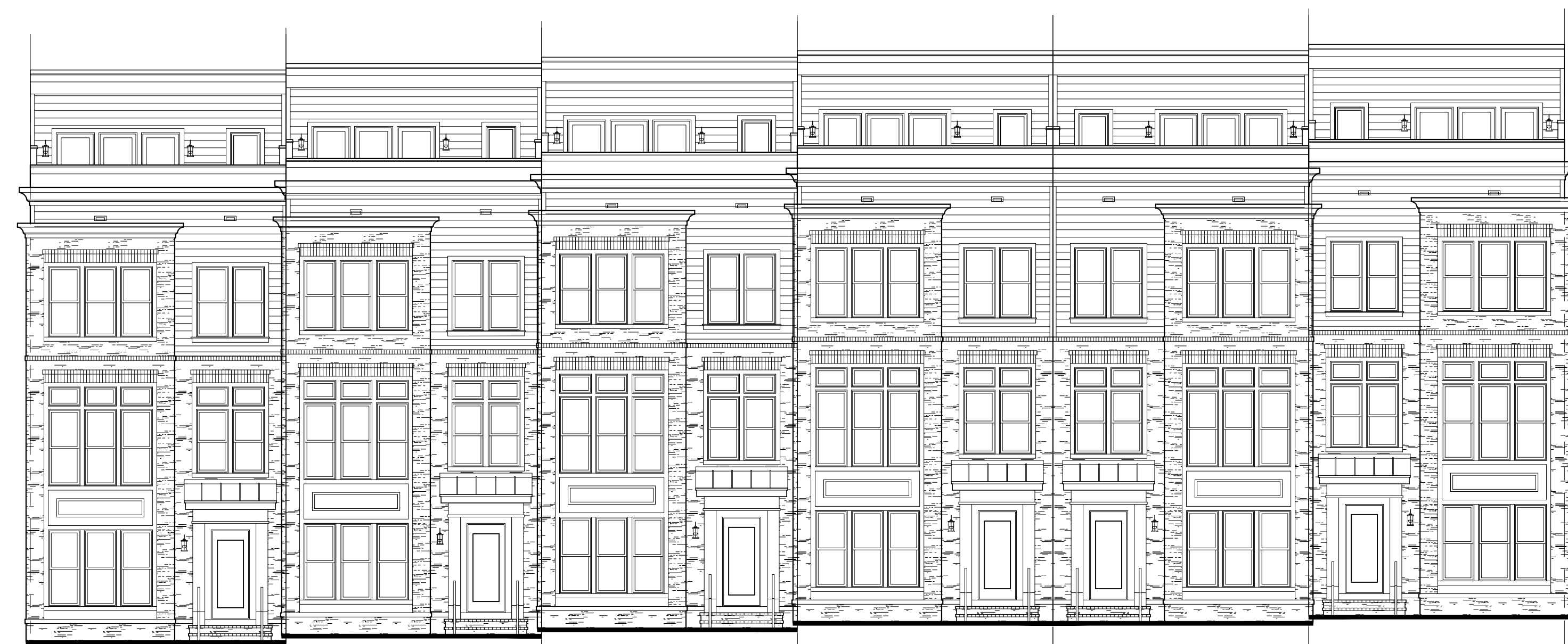
1 FRONT ELEVATION - BUILDING #7 Scale: 1/8"=1'-0"