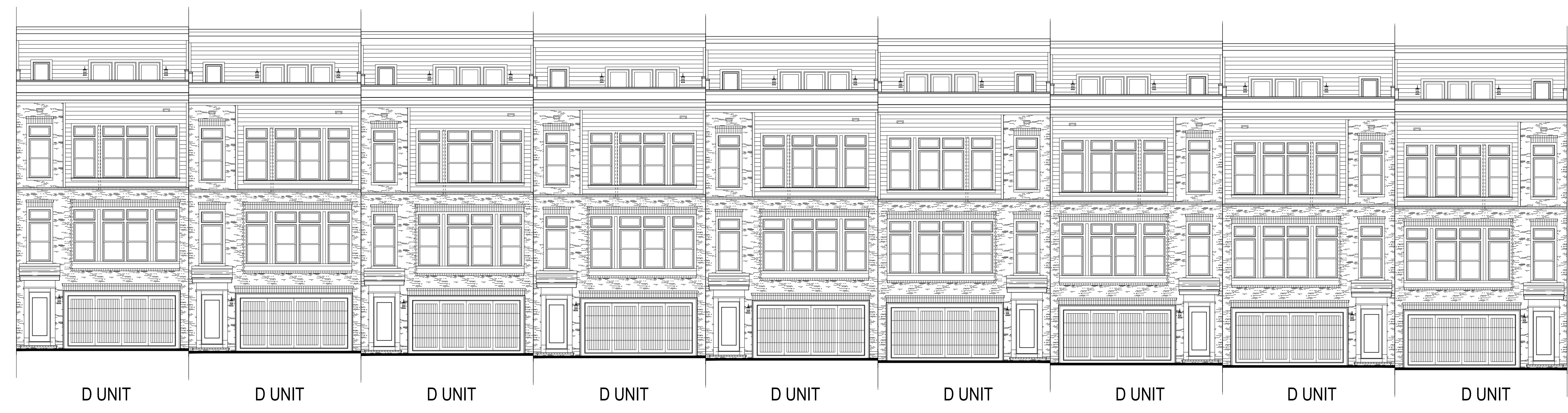
1 FRONT ELEVATION - BUILDING #8 Scale: 1/8"=1'-0"