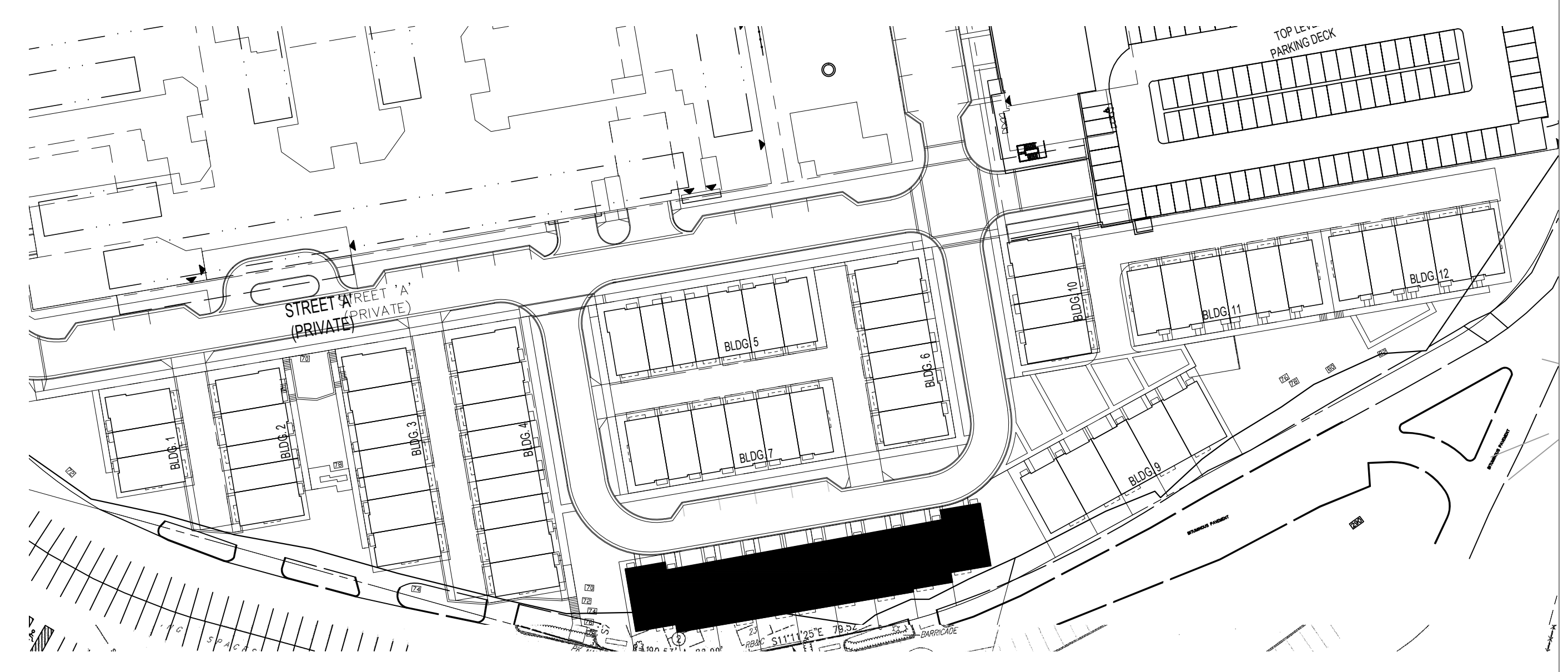
0 KEY PLAN Scale: N.T.S.