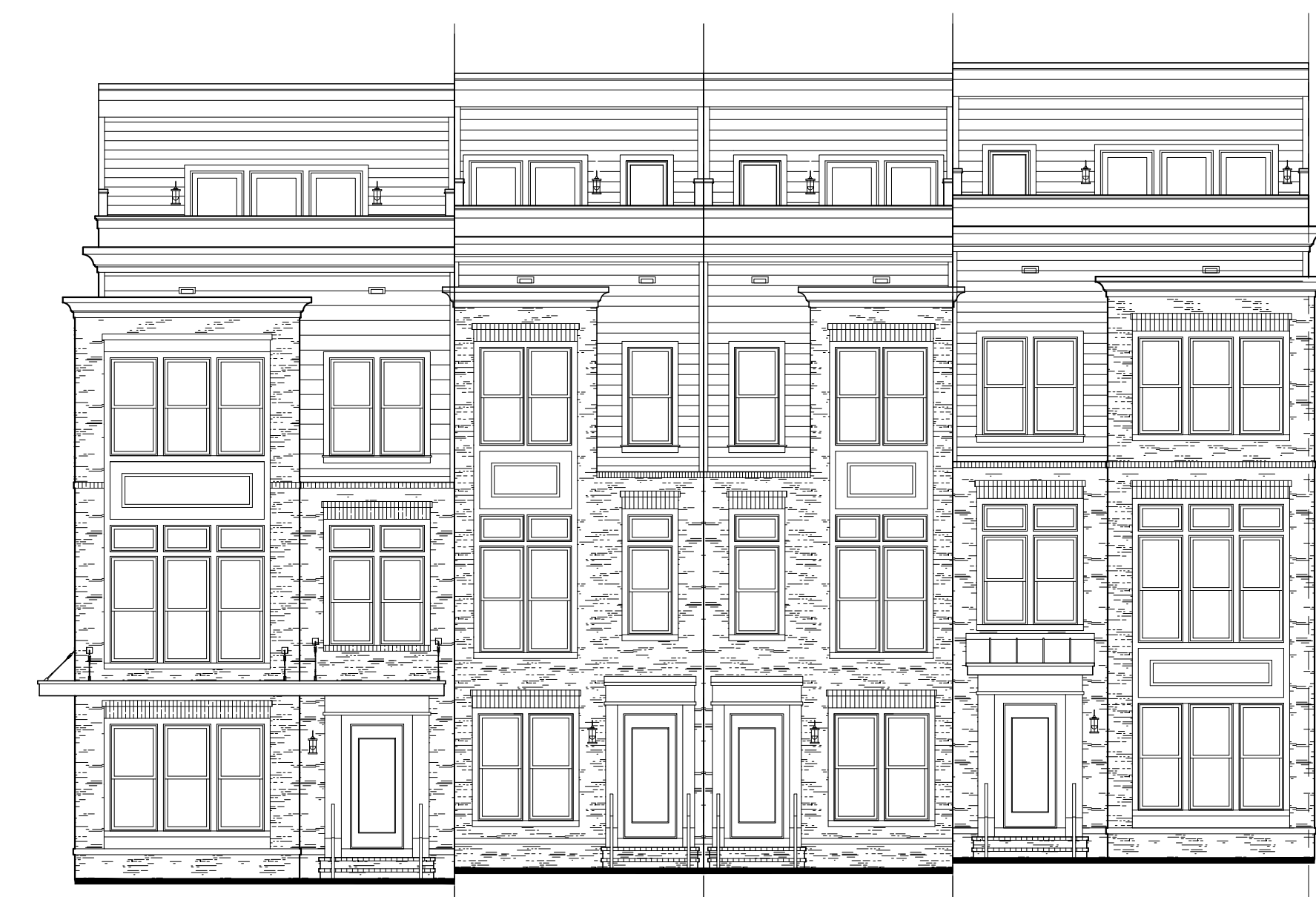
1 FRONT ELEVATION - BUILDING #10 Scale: 1/8"=1'-0"