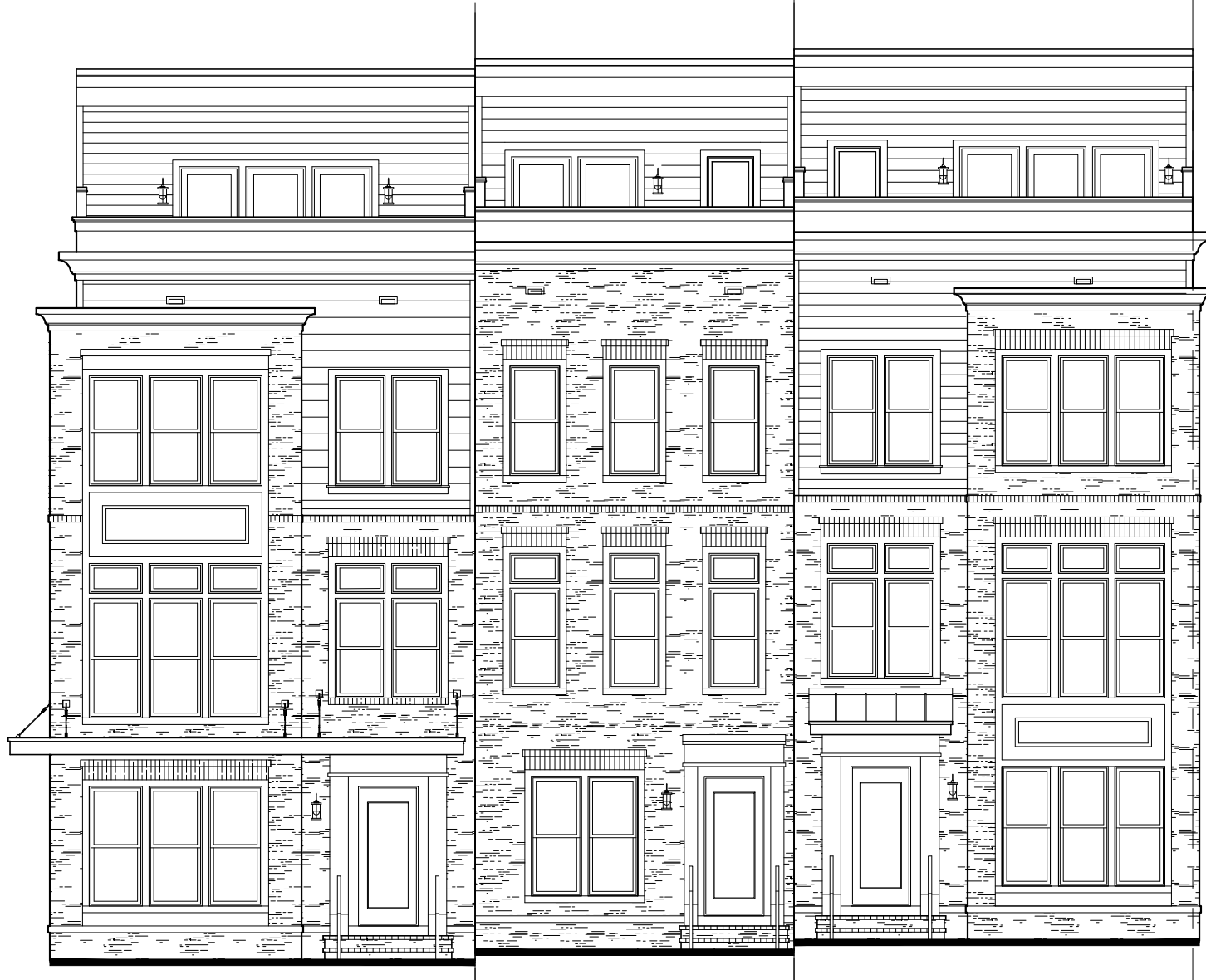
1 FRONT ELEVATION - BUILDING #10 Scale: 1/8"=1'-0"