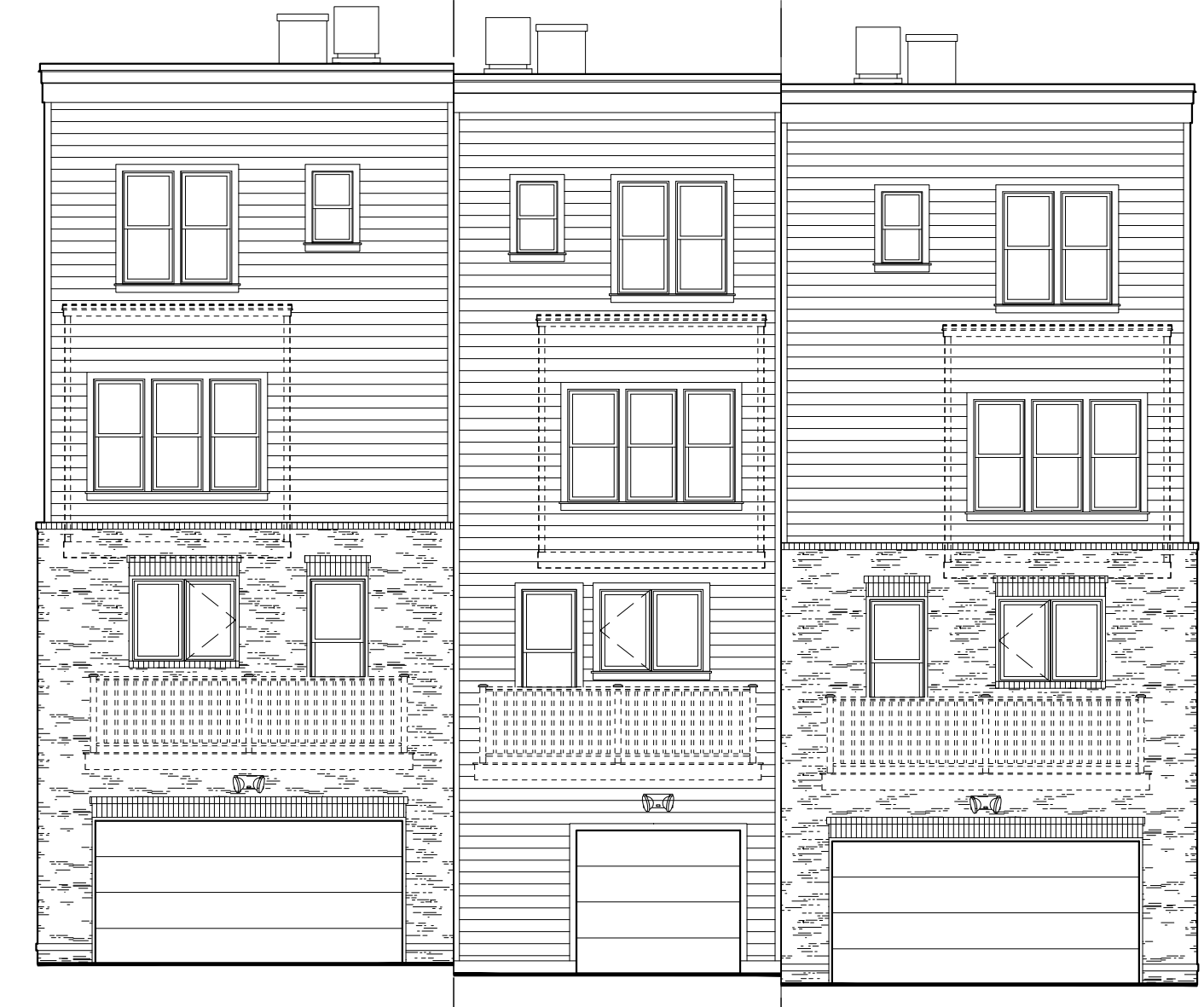
4 REAR ELEVATION - BUILDING #10 Scale: 1/8"=1'-0"

NOTE: FINAL BUILDING LOCATIONS, DIMENSIONS, HEIGHT, AND UNIT TYPE DESIGNATIONS TO BE DETERMINED AT TIME OF CERTIFIED SITE PLAN. THE PROPOSED ARCHITECTURAL DETAILS AND MATERIALS ARE CONCEPTUAL AND SUBJECT TO REVISION AT THE TIME OF CERTIFIED SITE PLAN.