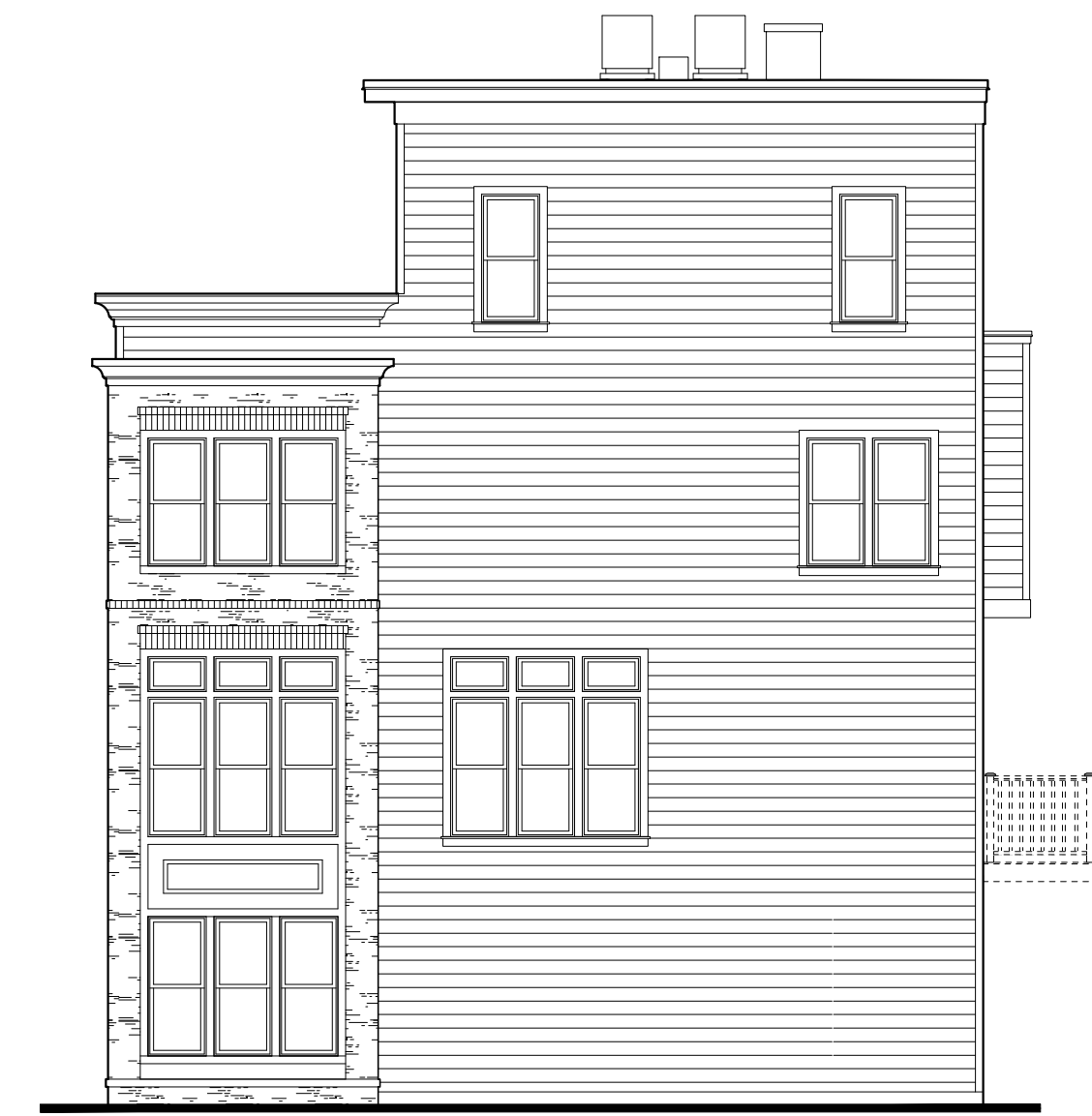
2 RIGHT SIDE ELEVATION - BUILDING #11 Scale: 1/8"=1'-0"