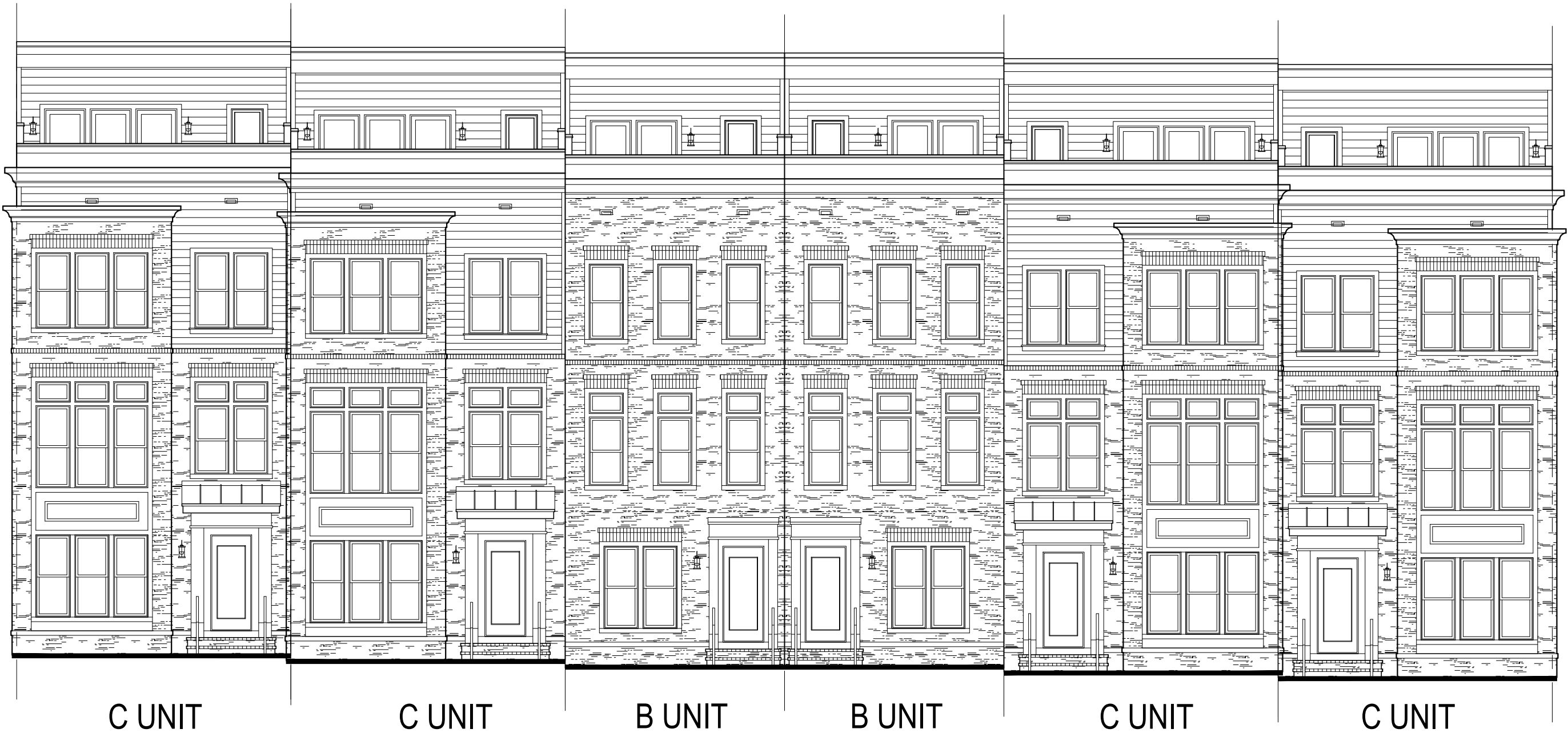
1 FRONT ELEVATION - BUILDING #11 Scale: 1/8"=1'-0"