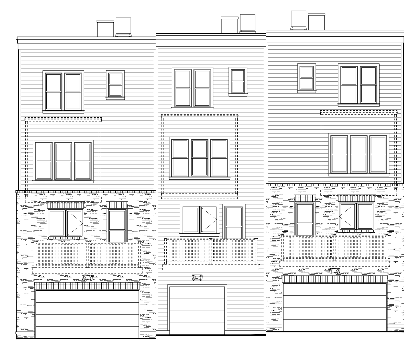
4 REAR ELEVATION - BUILDING #11 A-320 Scale: 1/8"=1'-0"

NOTE: FINAL BUILDING LOCATIONS, DIMENSIONS, HEIGHT, AND UNIT TYPE DESIGNATIONS TO BE DETERMINED AT TIME OF CERTIFIED SITE PLAN. THE PROPOSED ARCHITECTURAL DETAILS AND MATERIALS ARE CONCEPTUAL AND SUBJECT TO REVISION AT THE TIME OF CERTIFIED SITE PLAN.