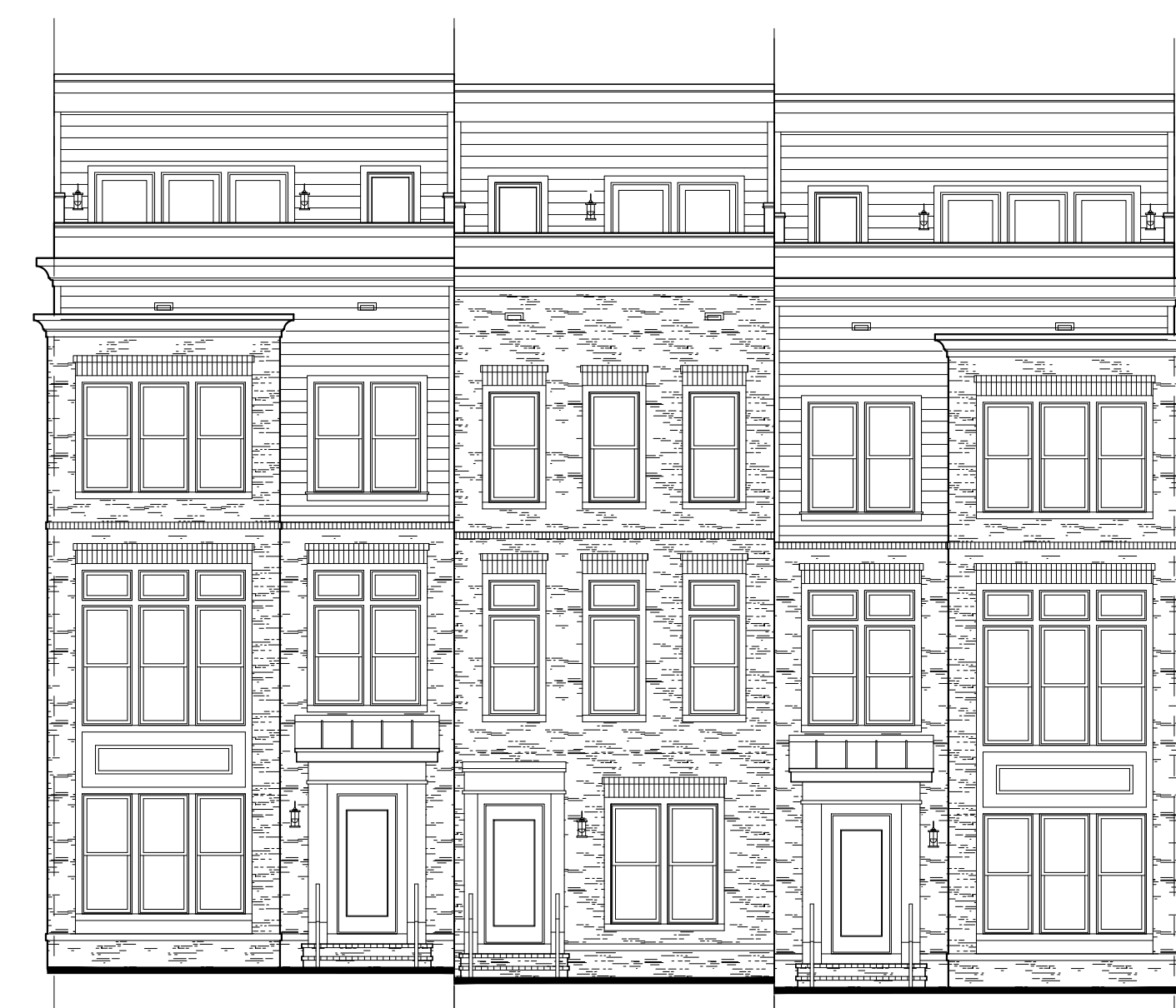
1 FRONT ELEVATION - BUILDING #11 A-320 Scale: 1/8"=1'-0"