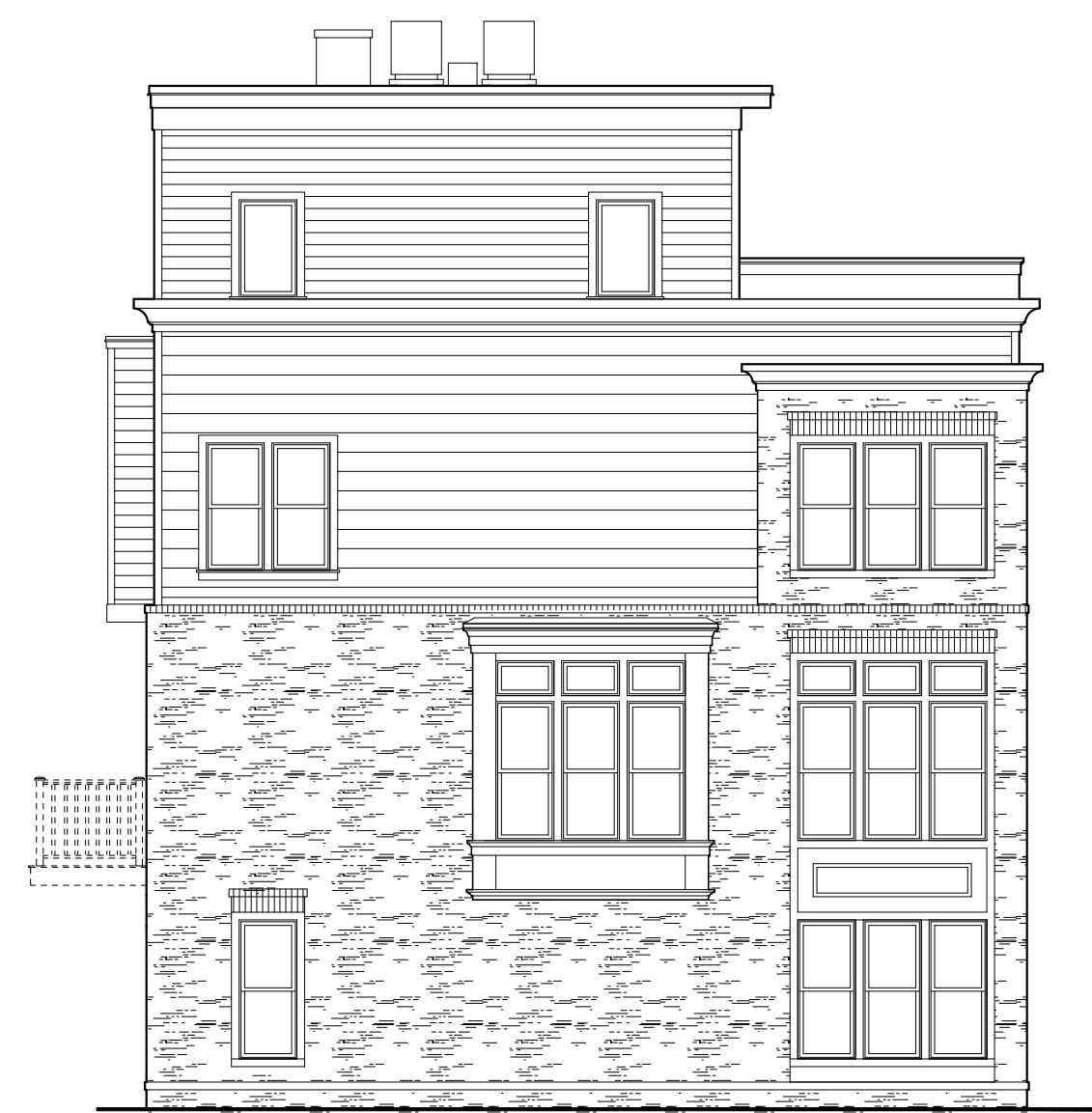
3 LEFT SIDE ELEVATION - BUILDING #11 A-320 Scale: 1/8"=1'-0"