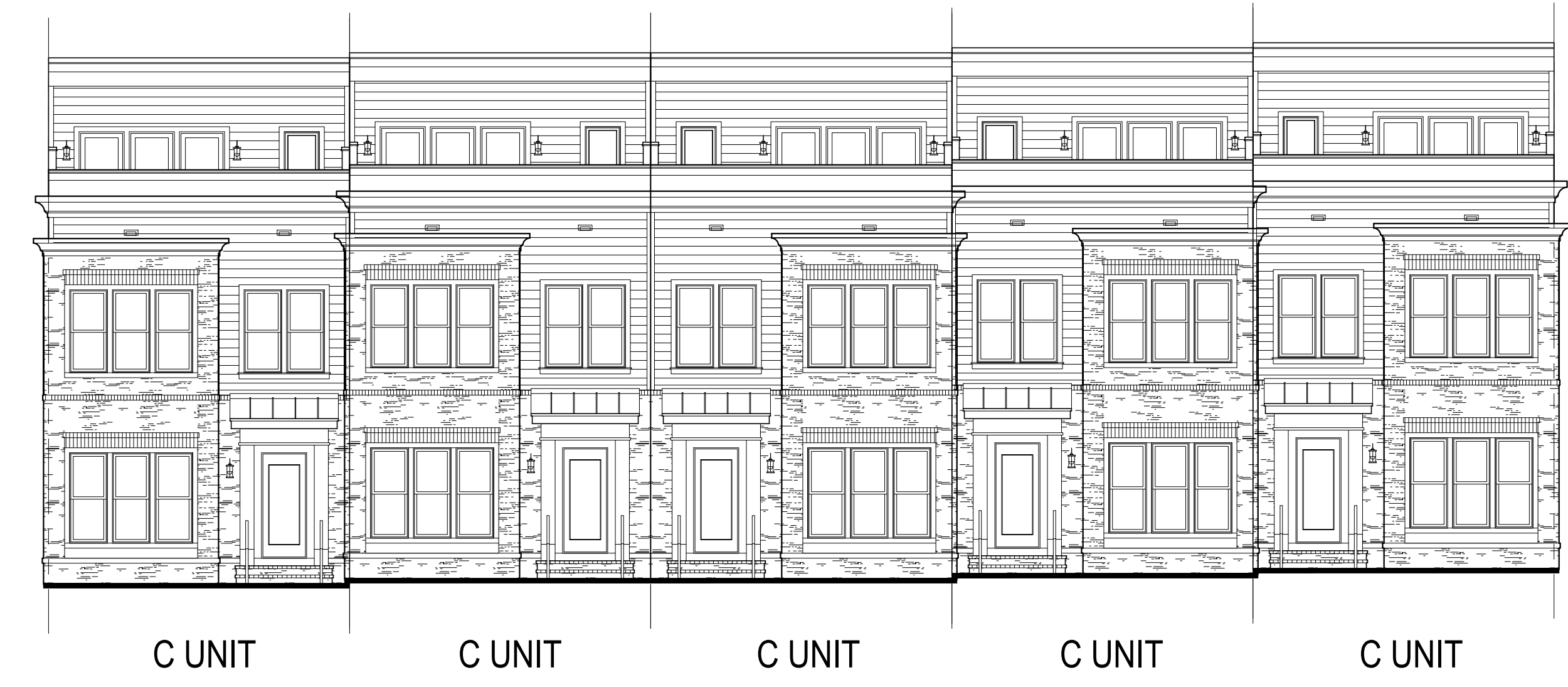
FRONT ELEVATION - BUILDING #12 Scale: 1/8"=1'-0"