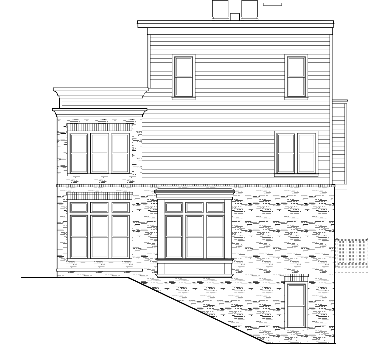
RIGHT SIDE ELEVATION - BUILDING #12 Scale: 1/8"=1'-0"