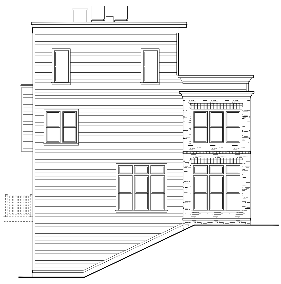
LEFT SIDE ELEVATION - BUILDING #12 Scale: 1/8"=1'-0"