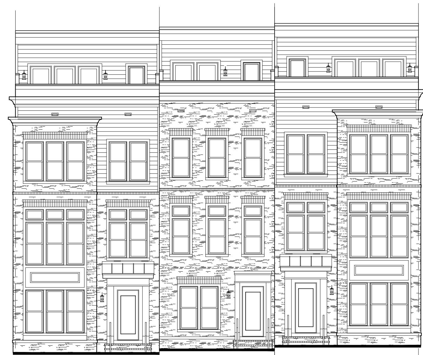
1 FRONT ELEVATION - BUILDING #12 Scale: 1/8"=1'-0"