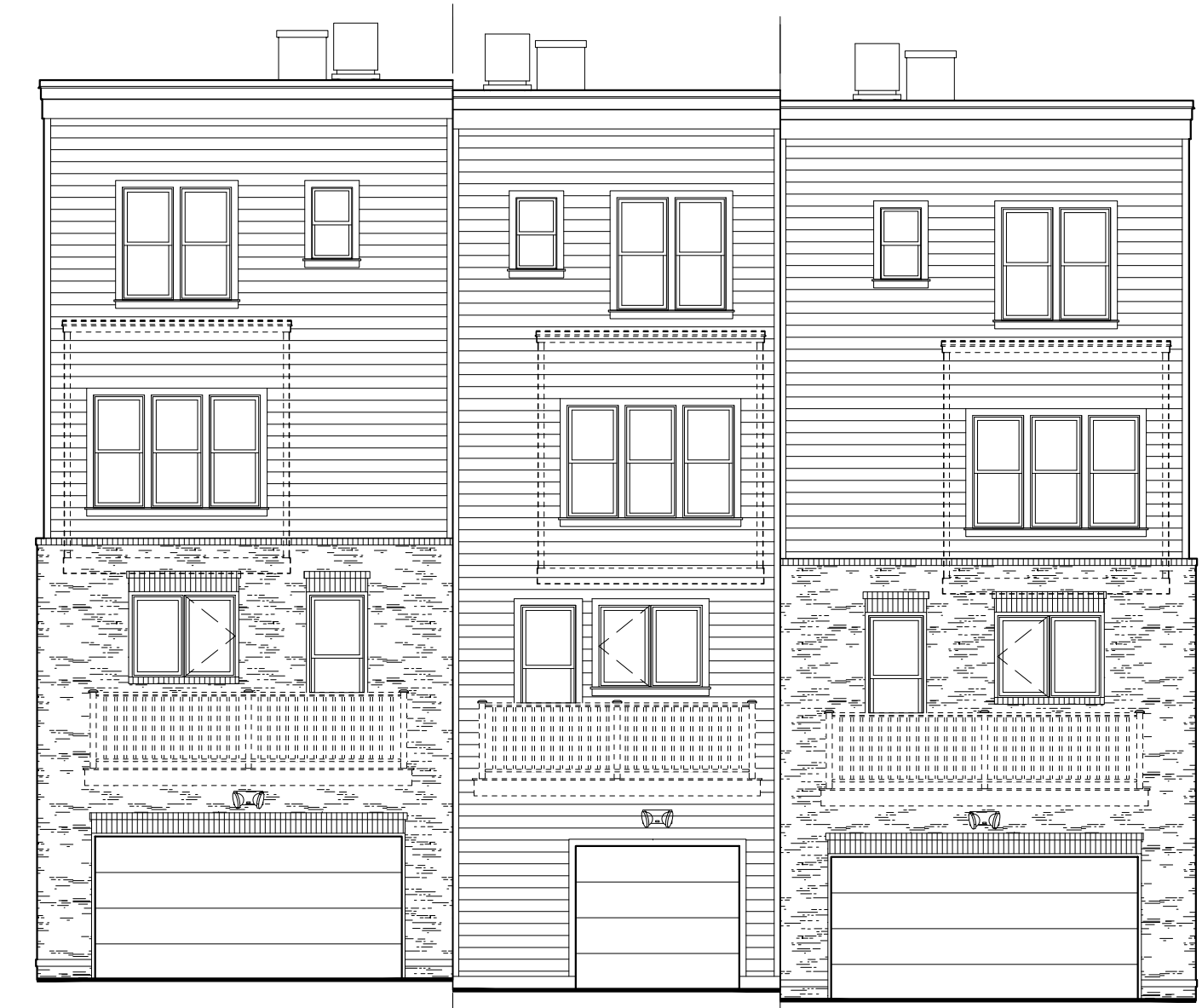
4 REAR ELEVATION - BUILDING #12 Scale: 1/8"=1'-0"

NOTE: FINAL BUILDING LOCATIONS, DIMENSIONS, HEIGHT, AND UNIT TYPE DESIGNATIONS TO BE DETERMINED AT TIME OF CERTIFIED SITE PLAN. THE PROPOSED ARCHITECTURAL DETAILS AND MATERIALS ARE CONCEPTUAL AND SUBJECT TO REVISION AT THE TIME OF CERTIFIED SITE PLAN.