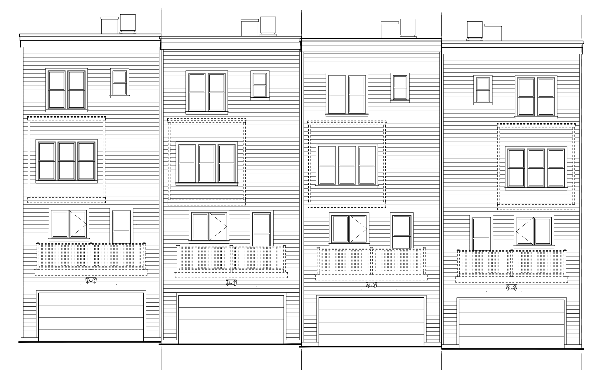
4 REAR ELEVATION - BUILDING #13 Scale: 1/8"=1'-0"

NOTE: FINAL BUILDING LOCATIONS, DIMENSIONS, HEIGHT, AND UNIT TYPE DESIGNATIONS TO BE DETERMINED AT TIME OF CERTIFIED SITE PLAN. THE PROPOSED ARCHITECTURAL DETAILS AND MATERIALS ARE CONCEPTUAL AND SUBJECT TO REVISION AT THE TIME OF CERTIFIED SITE PLAN.