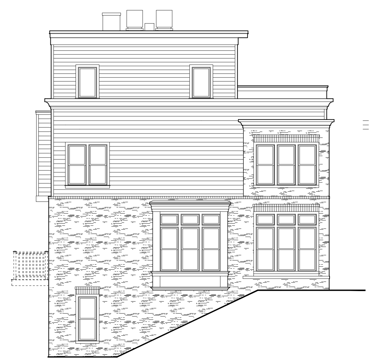
3 LEFT SIDE ELEVATION - BUILDING #13 Scale: 1/8"=1'-0"