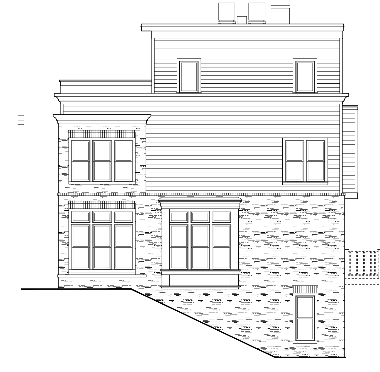
2 RIGHT SIDE ELEVATION - BUILDING #13 Scale: 1/8"=1'-0"