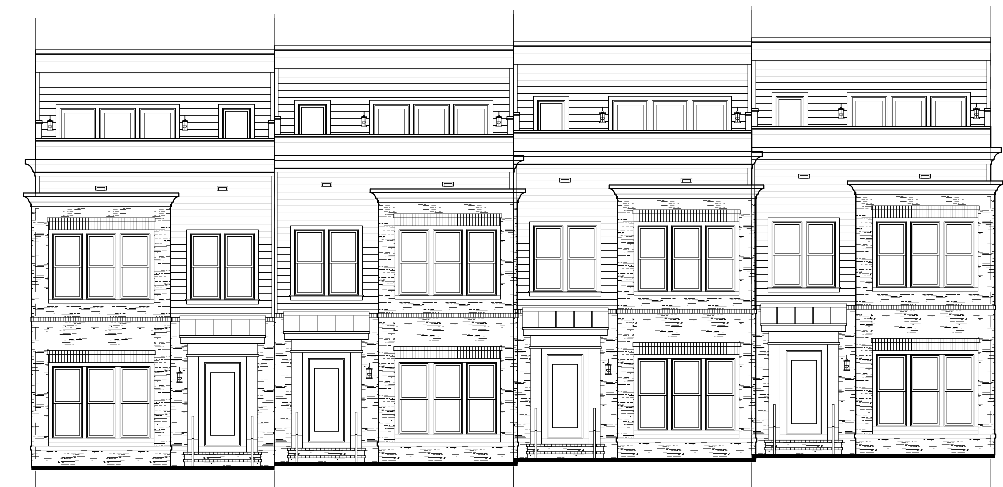
1 FRONT ELEVATION - BUILDING #13 Scale: 1/8"=1'-0"